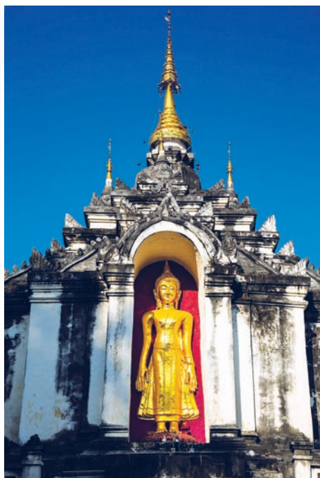
Wat Phra Yuen

India. Standing Buddha images in the gesture of giving a blessing are situated in the niches on each receding tier. The pagoda contains the ashes of Phranang Chammathewi, the first ruler of Nakhon Hariphunchai. From a legend, Prince Anantayot and Prince Mahantayot, sons of Phranang Chammathewi, ordered to build the pagoda to store the ashes of their mother in 755. Later, the top of the pagoda, which was formerly covered with gold plates, was broken and lost. Therefore, it is called “Ku Kut”-a truncated pagoda, or formally called “Phra Chedi Suwan Changkot”.