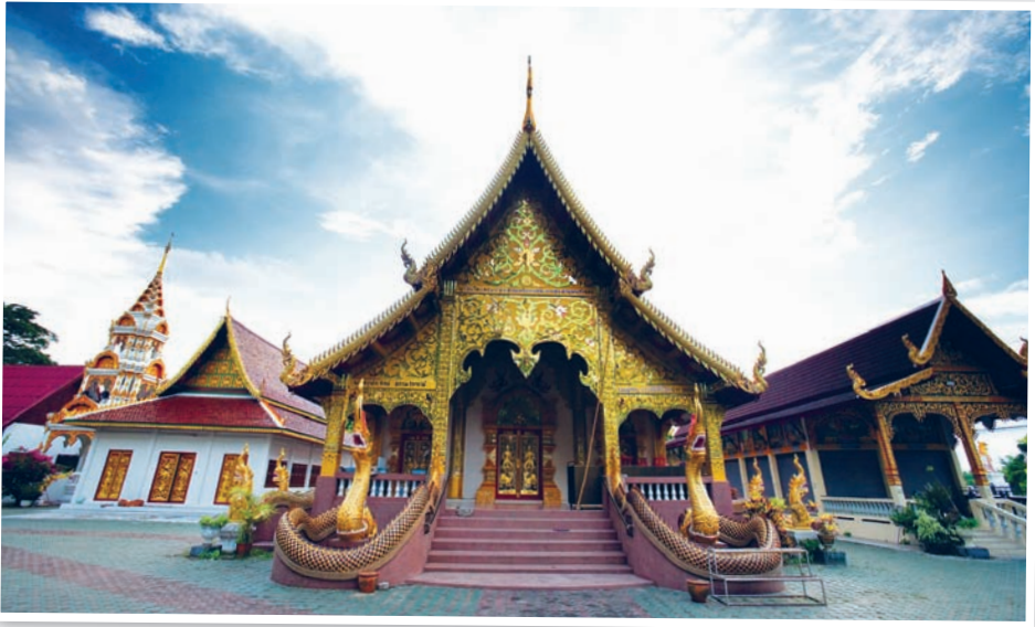
Wat Mu Poeng

in Lamphun. The scripture hall here is a half-cement-half-wooden building with the upper part featuring a wooden structure covered with a double semi-tiered roof decorated with traditional roof decorations; namely, Cho Fa, Bai Raka, and Hang Hong, all carved out of wood and decorated with coloured glass inlay. It is surrounded by a narrow balcony and has no stairs but is accessible by a movable ladder through a small opening. The lower part features 4 rows of 5 large columns each and serves as an ordination or image hall where the principal Buddha image is enshrined, bordered by railings.