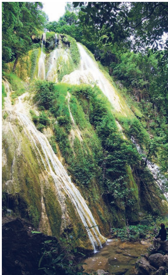
Namtok Ko Noi

is a five-tiered waterfall, which is emerald green