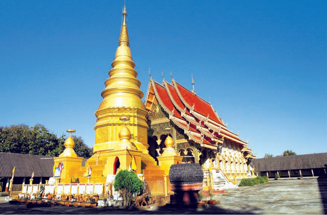
Wat Phrathat Ha Duang

at Mu 9, Ban Nong Pu (Huai Tom), Tambon Na Sai. Regarded as a replica of the Shwedagon Pagoda in Myanmar, its style was influenced by Lanna Buddhist architecture. Its base has a width and length of 40 metres, or equal to a total size of 1 rai (1,600 square metres), and a height of 64.39 metres. Luangpu Khruba Chaiyawongsa Phatthana initiated to design and construct the pagoda with an aim to pay respect to the five Buddhas. It is the first Buddha chedi of the current world cycle in Thailand and the second in the world.