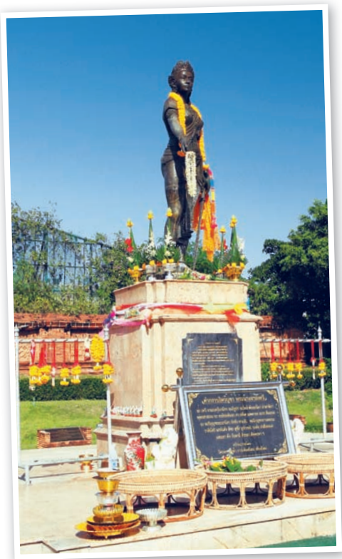
Memorial of Phranang Chammathewi

is situated in Tambon Nai Mueang, near Nong Dok Park, about 1 kilometre from the City Hall. The memorial was built to commemorate Phranang Chammathewi, the first ruler of Hariphunchai City. She was a moral, versatile and brave philosopher, who disseminated