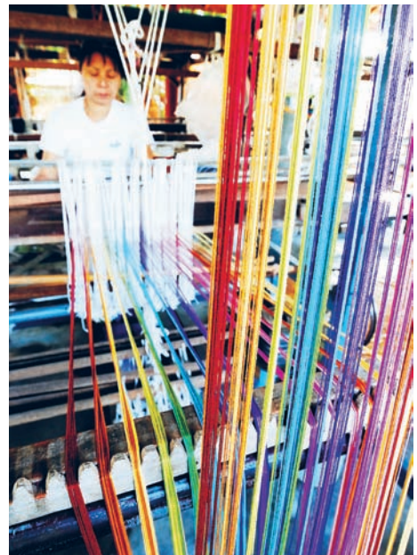
Hand-made cotton fabric

Rom Mai Garden (สวนอาหารร่มไม้) Phahonyothin Road (9.00 a.m.-10.00 p.m.)