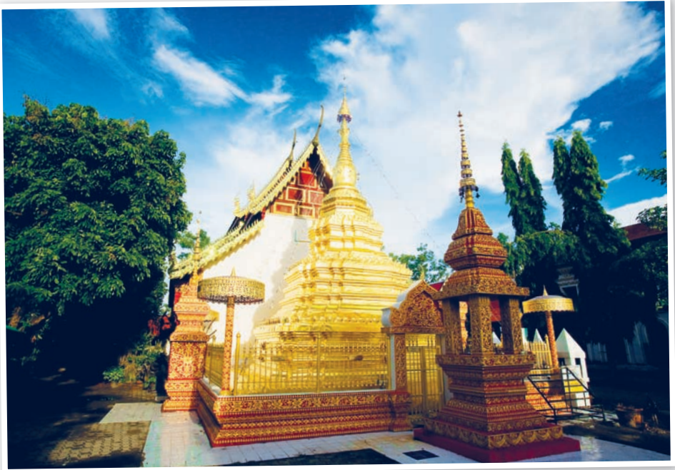
Wat Nong Ngueak