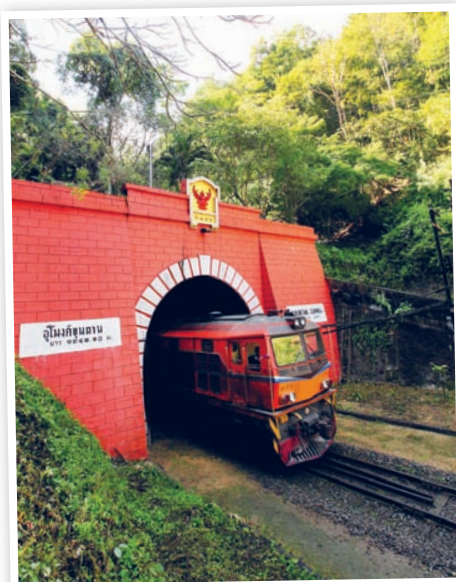
Khun Tan Tunnel

is a small waterfall with a height of 10 metres on the way from Strategy Point 2 to Strategy Point 3. Turn left at the junction and go on for about 1,500 metres. Walk down to the Mae Yon Wai Valley for about 300 metres.