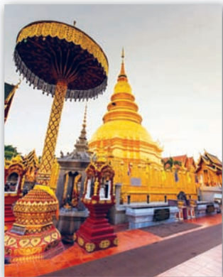
Wat Phrathat Hariphunchai Woramahawihan