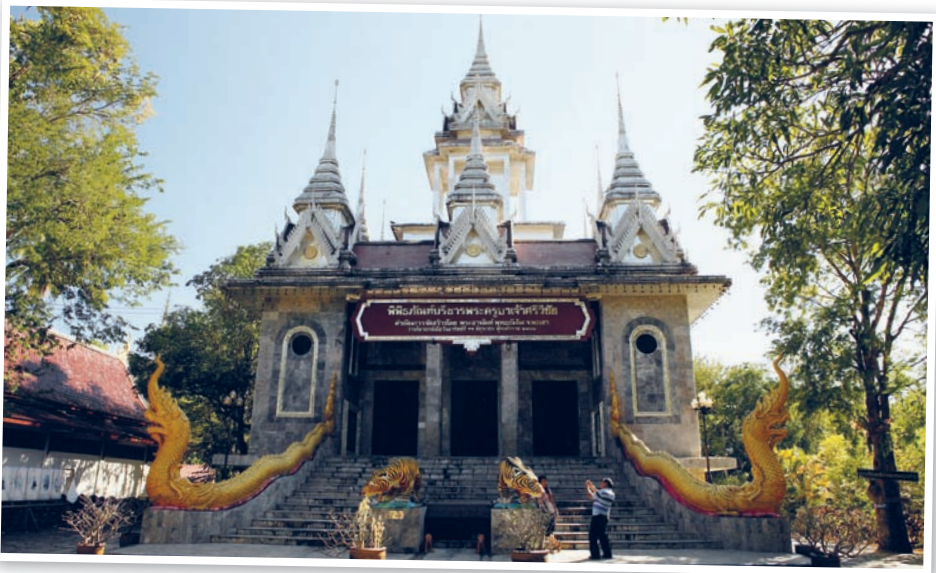
Wat Ban Pang