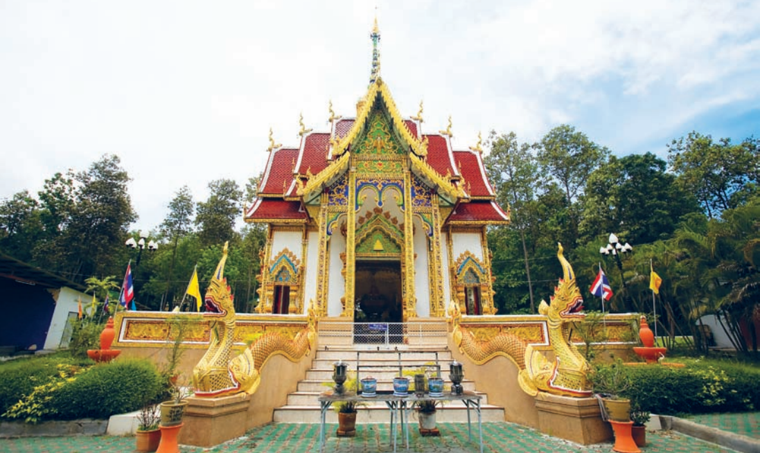
Wat Phrathat Doi Wiang