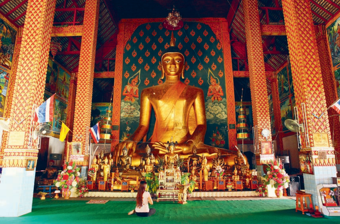
Wat Phrachao Ton Luang

years ago, influenced by the Hariphunchai arts. In addition, remains of Dvaravati architecture were found. In this connection, the Lamphun Provincial Administration Organization has allocated a budget to excavate and restore the Boran Sathan Wat Ko Klang to be another source of learning and an archaeological tourist attraction in Lamphun. For details, Tel. 0 5359 3100.