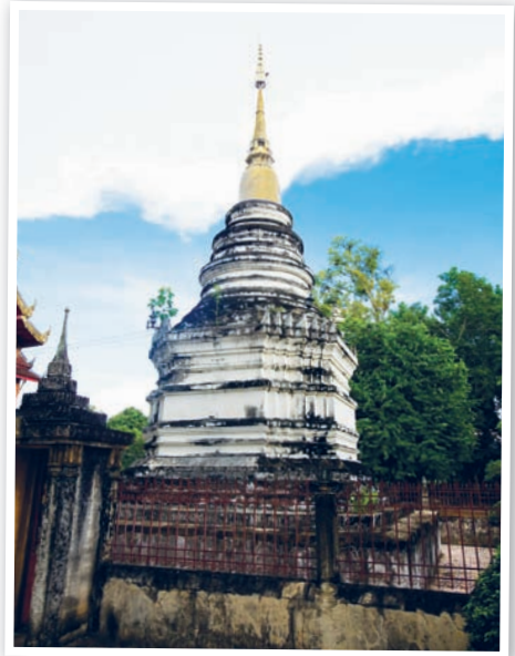
Wat Phrachao Saliam Wan

is located at Tambon Ban Hong, on Highway No. 106 (the Lamphun-Li route), near Km. 113. From Ban Hong Luang, drive on for about 4