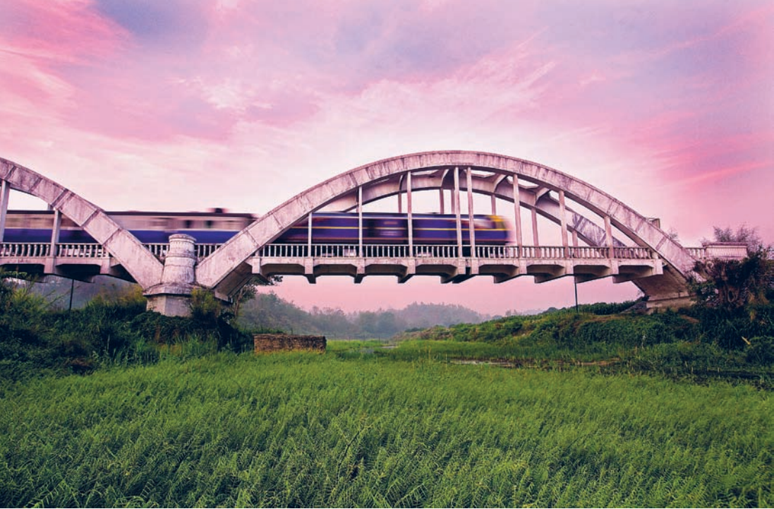
Saphan Tha Chomphu or Tha Chomphu Bridg

There are shops on the right where visitors can park their cars and walk for another 300 metres along the railway to the bridge. Otherwise, visitors may take a motorcycle from Amphoe Mae Tha.