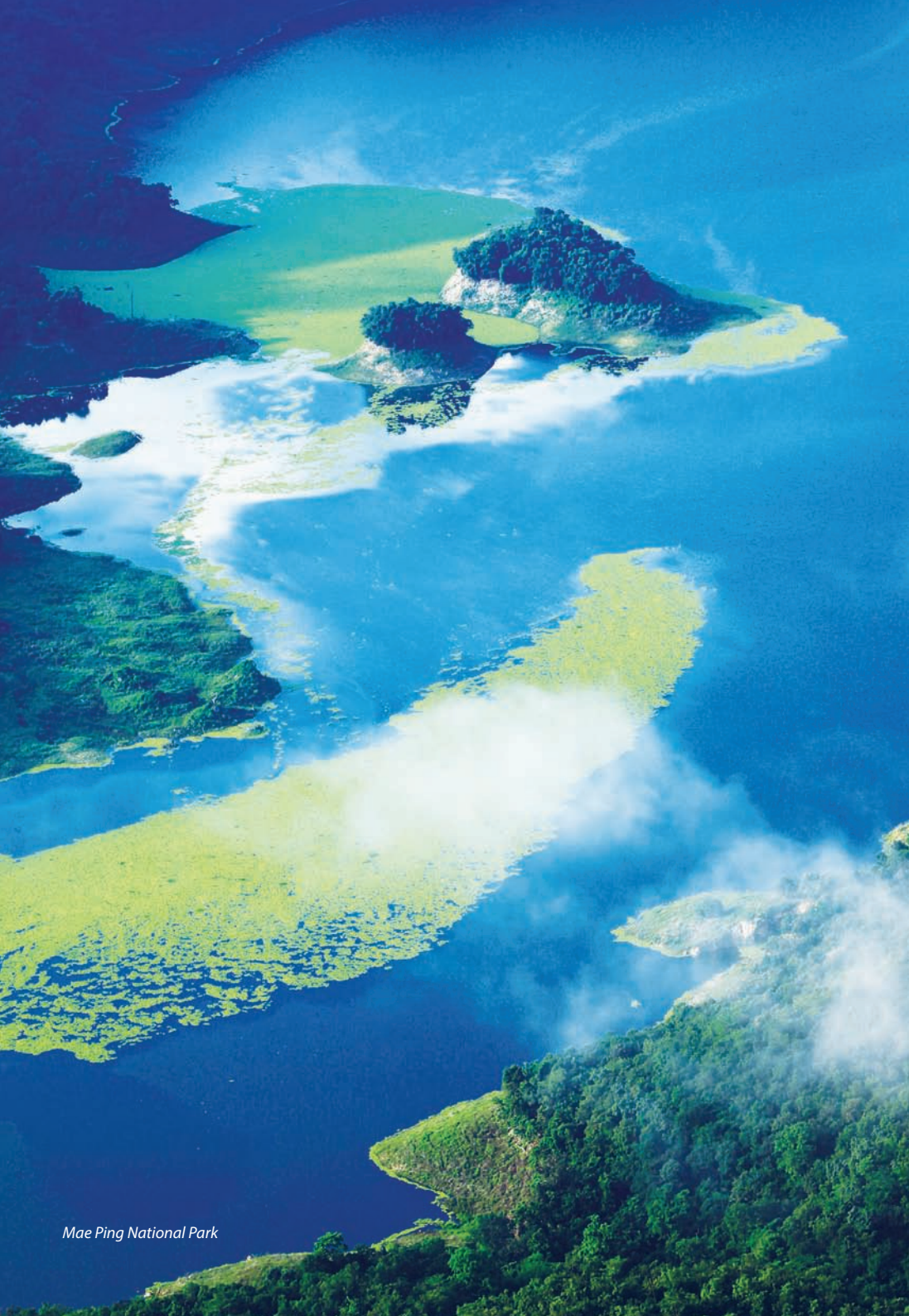
Mae Ping National Park