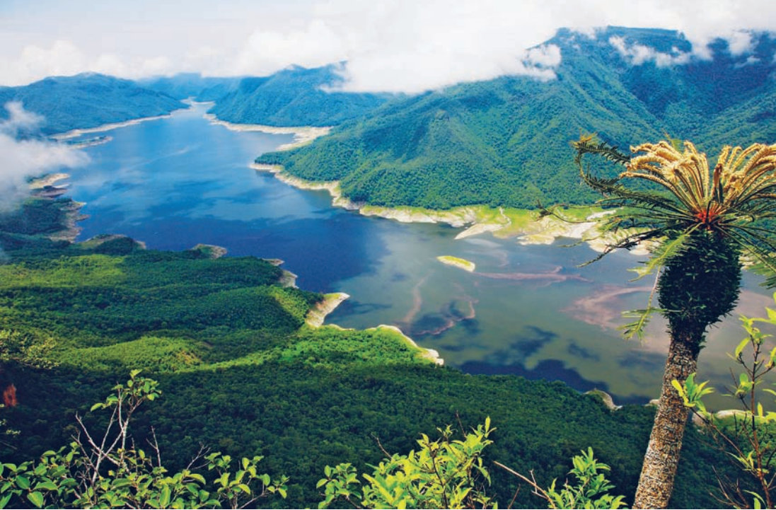
Mae Ping National Park

can rent a boat or raft to cruise upward from the Bhumibol Dam.