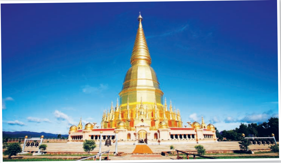
Wat Mahathat Chedi Si Wiang Chai

about 70 kilometres until getting to Amphoe Thung Hua Chang and Ban Pong Daeng Intersection on Chaiyawongsa Phatthana Road. Drive on for about 4 kilometres before reaching the temple.