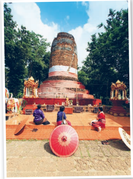
Ku Chang-Ku Ma

is a historical site located in the Wat Kai Kaeo community, Soi Rongrian Chakkham Khanathon, about 1 kilometre from the city. Ku Chang or Elephant Stupa is a cylinder-shaped stupa with a round top which is believed to be the cemetery of the war elephant of Phranang Chammathewi. The elephant was named “Phu Kam Nga Khiao” which means dark elephant with green tusks, its very strong weapons. Ku Ma or Horse Stupa is a stupa in a bell-like shape which is believed to be the cemetery of the son of Phranang Chammathewi’s mount.