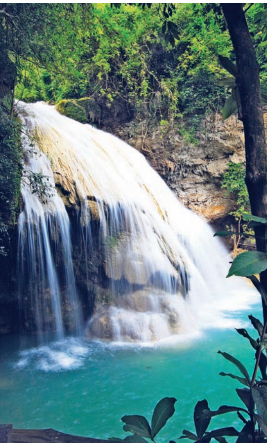
Namtok Ko Luang