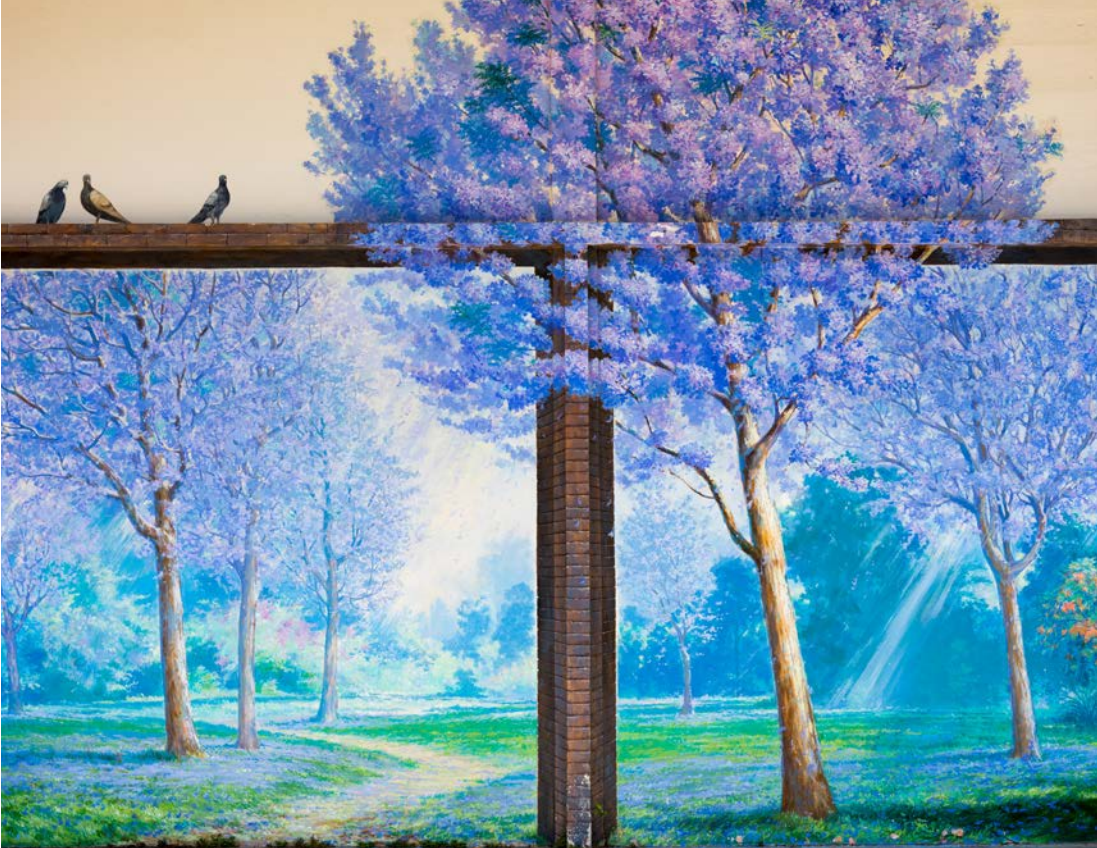
Street Art Thap Thiang Old Town