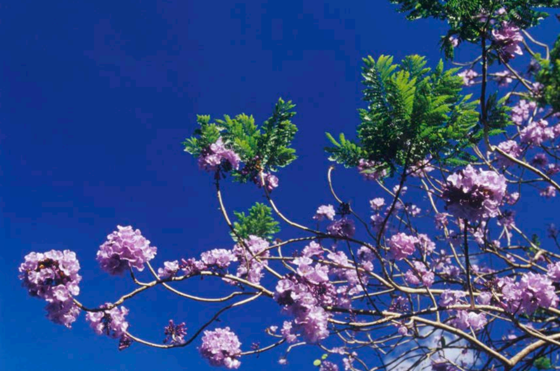
Sitrang Flower or Green Ebony