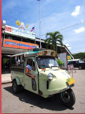
Tuk Tuk Hua Kop