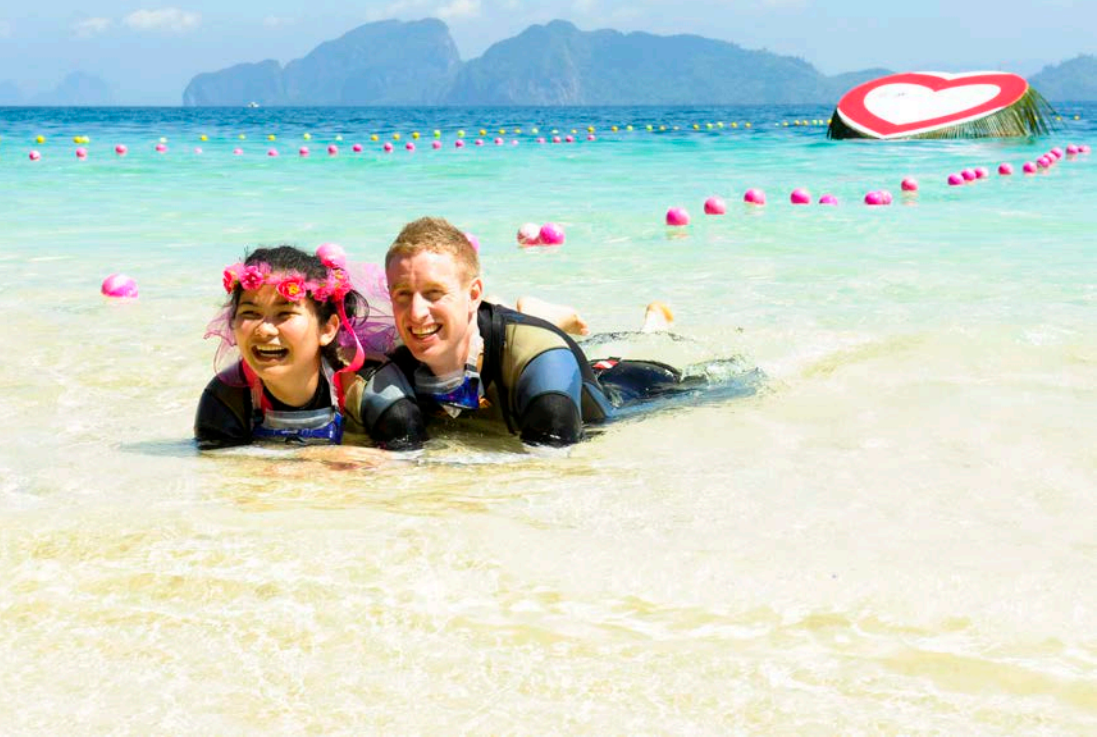
Trang Underwater Wedding Ceremony

of off-road racing clubs in Thailand and from foreign countries, such as Malaysia, Singapore, Indonesia, etc., with more than 100 cars participating. It is scheduled for September of every year. The circuits in use are in Trang town and other districts of Trang.