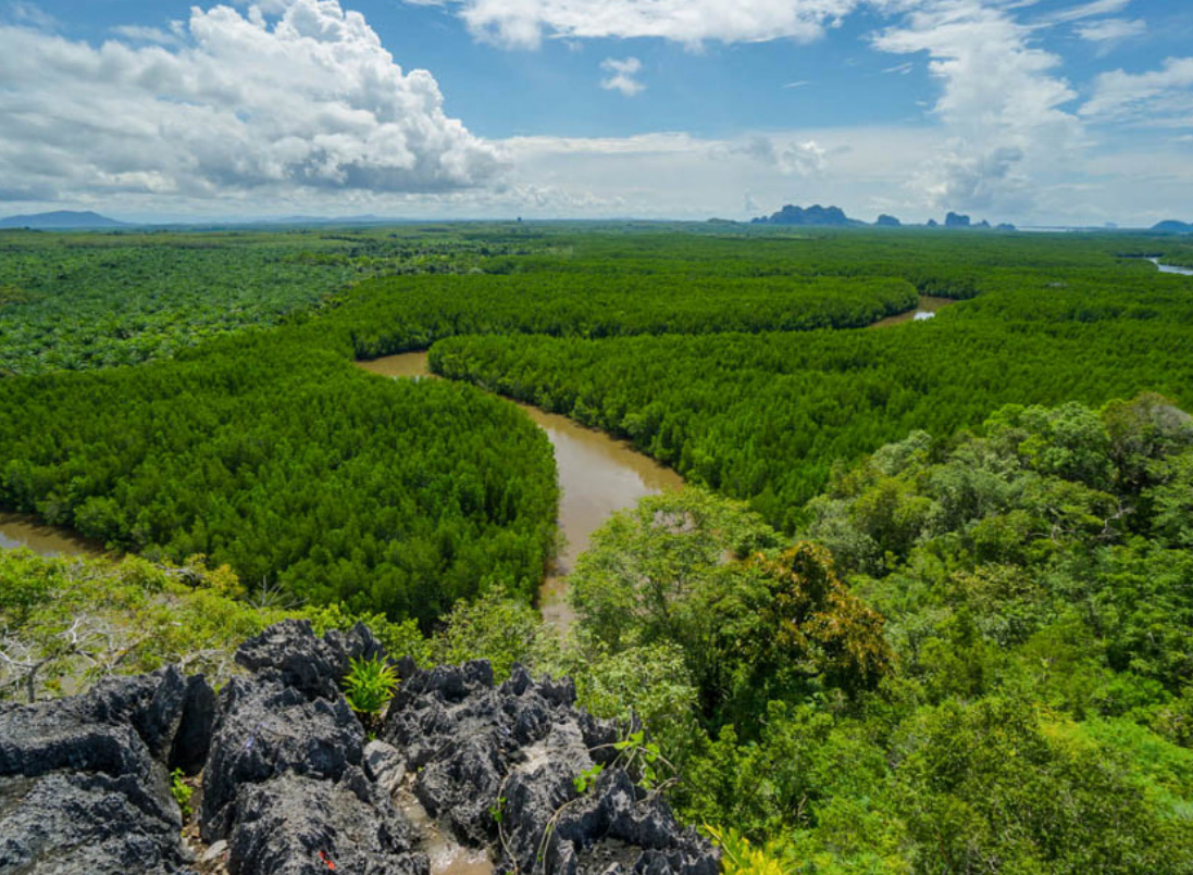
Khao Chom Pa

more information, please contact the Trang Chamber of Commerce at Tel. 0 7529 0181