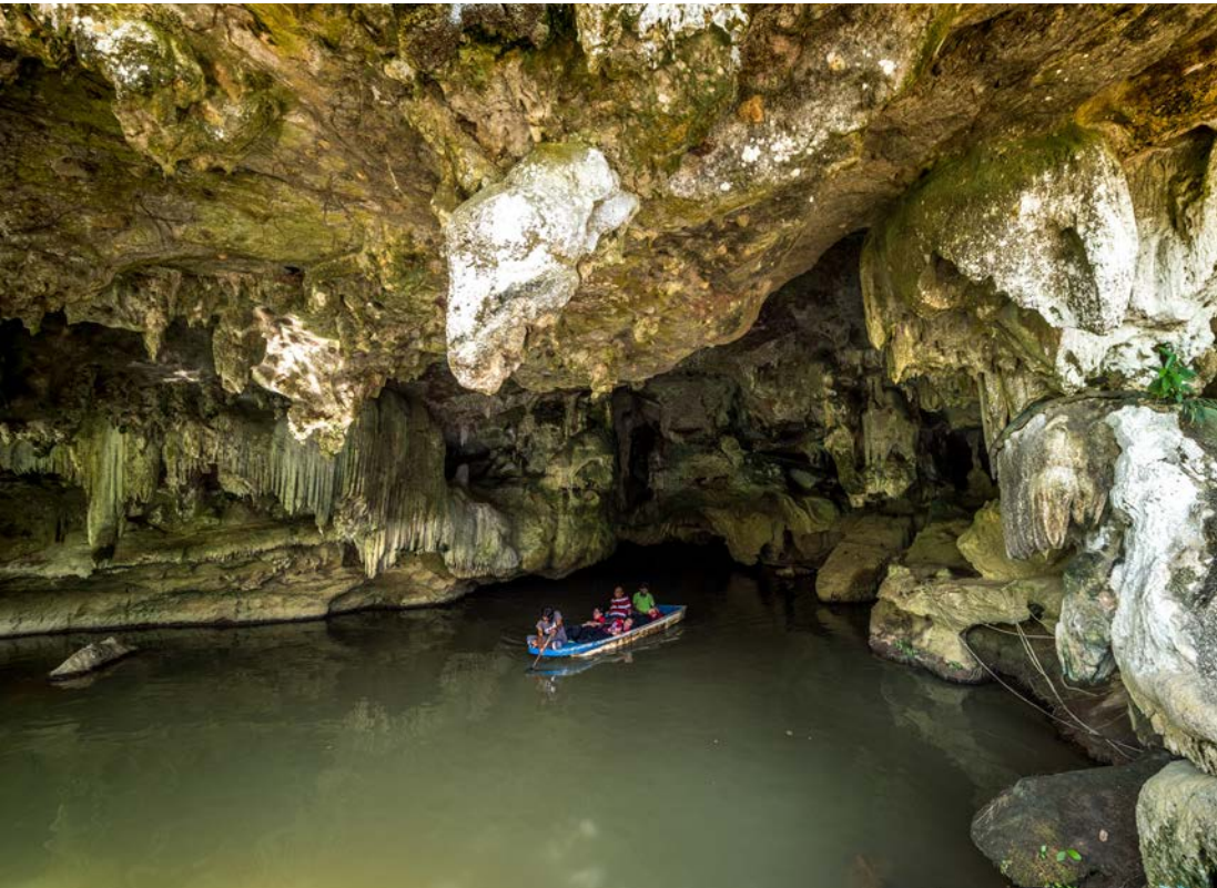
Tham Le Khao Kob

is located at Mu 1, Tambon Khao Kop, formerly is a large source of freshwater reserved for the dry season. It was later developed to be an adventure attraction by the Khao Hua