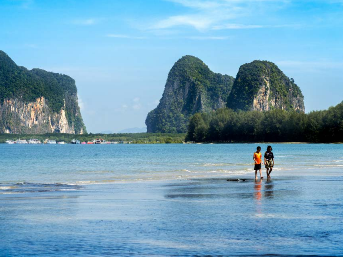
Hat Pak Meng

Interesting attractions within the National Park: Hat Pak Meng (หาดปากเมง) is at Mu 4, Tambon Mai Fat. The beautiful and peaceful 5-kilometre long beach is in the shape of a crescent moon. A lovely pine forest fringes the beach. Assorted large and small islands dot the sea, looking like a person lying face up in the ocean. There are hotel and restaurant are available. Boats from Pak Meng Pier take visitors to Ko Ngai and other islands close by.