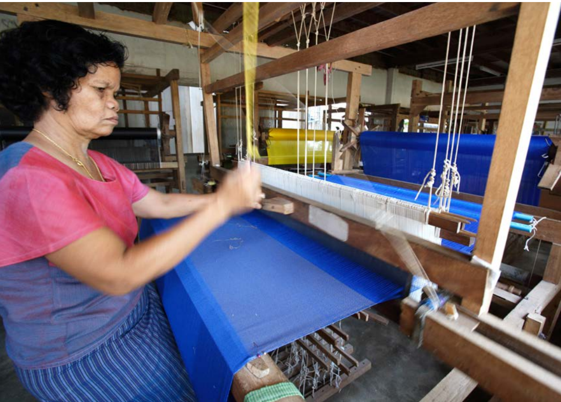
Na Muen Si Weaving Center

to maintain and save the art of local weaving from extinction. The woven cloth can be categorized by its structure into 3 types: plain, checked, and with raised motifs. The unique patterns of the Na Muen Si woven fabric include Lai Luk Kaeo, Lai Luk Kaeo Ching Duang, Lai Ratchawat, Lai Dok Chan, and Lai Dok Phikun. Presently, more than 30 favourite patterns are added. The fabric is applied in the production of souvenir products; such as, hat, shirt, bag etc. For more information, contact the Office of the Na Muen Si Weaving Centre at Tel. 0 7558 3524. To get there: From Amphoe Mueang Trang, take Highway No. 4 (Trang-Phatthalung), pass the