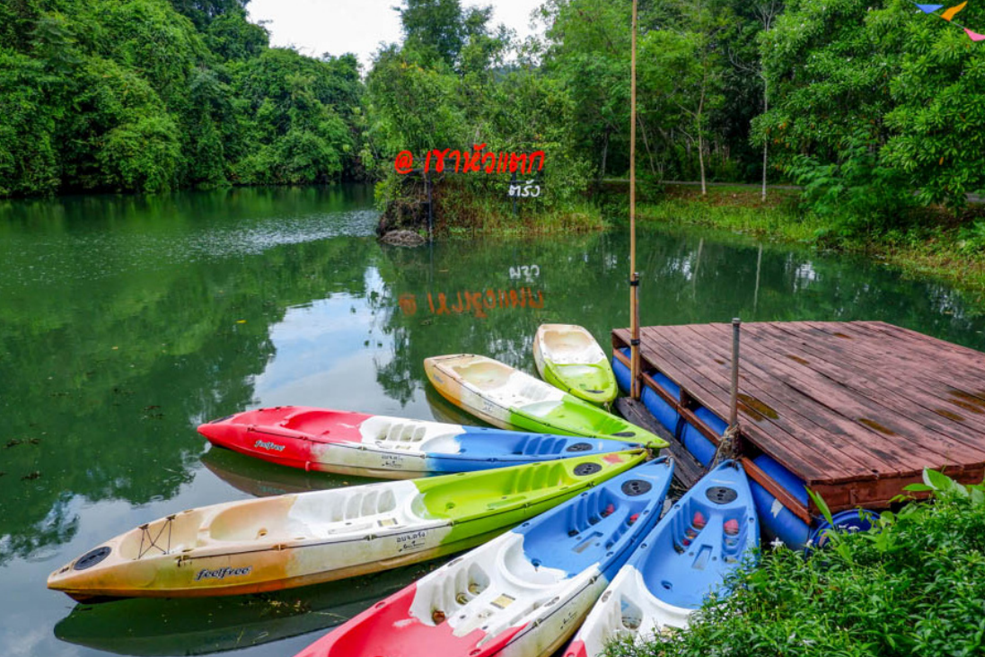
Khao Hua Taek

of approximately 4 kilometres and takes about 1 hour. For information, please contact the Ban Khao Lak Community Group, Tel. 08 2420 4691. To get there: From Trang City Hall, follow Highway No. 4123, the same route as WatPhukhao Thong, turn left about 700 metres beyond the temple's entrance and continue for some 5 kilometres to reach the village.