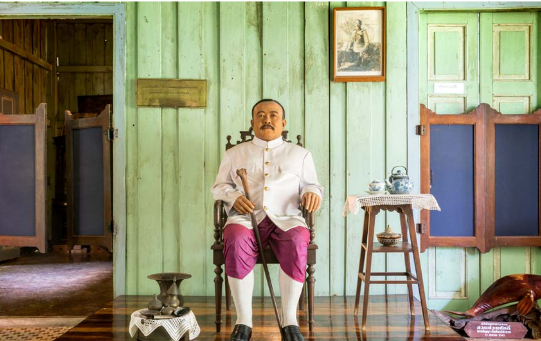
Phraya Ratsadanupradit Mahison Phakdi Museum

is around 200 metres from Kantang Municipality at No. 1, Khai Phithak Road, Tambon Kantang. It is the site of an important historical site, which