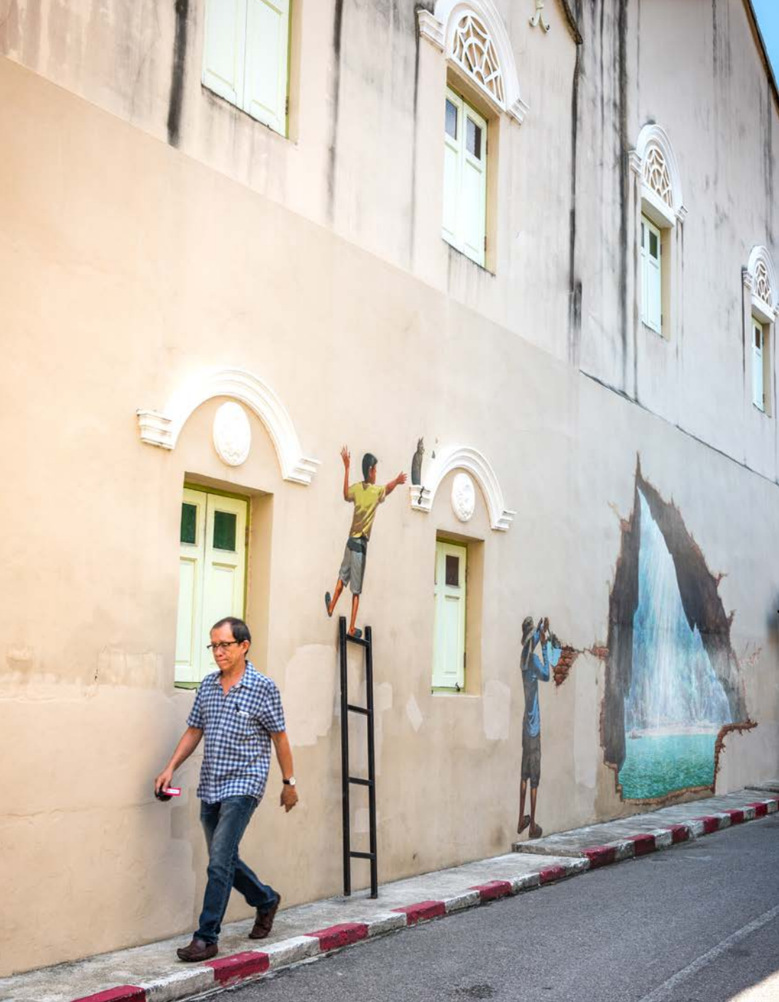
Street Art Thap Thiang Old Town