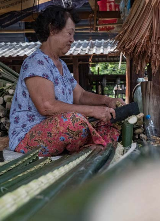
Ban Yan Sue Community