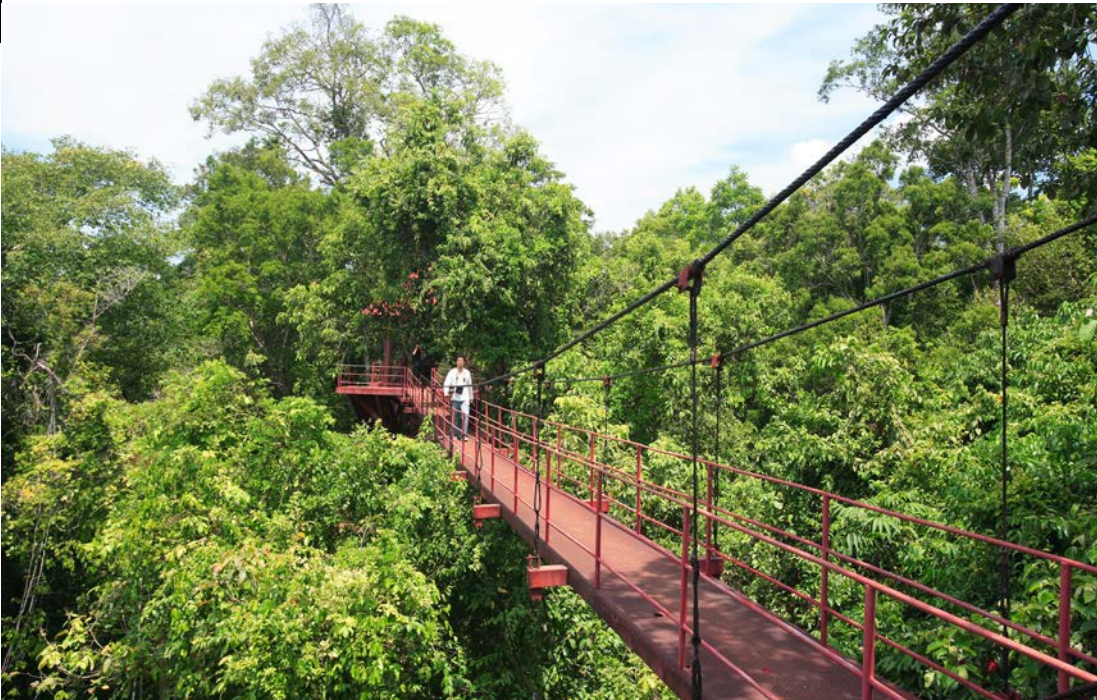
Peninsular Botanic Garden (Thung Khai)

is located in Tambon Thung Khai, it is a tourist attraction for those who are interested in the study of nature and vegetation. Inside, there is a tourist center, an arboretum, an herbal garden, a botanical library, an herbarium, a conference