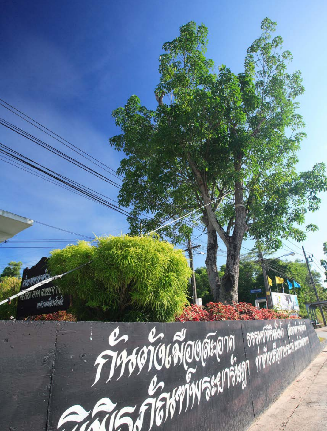
The first rubber tree in Thailand