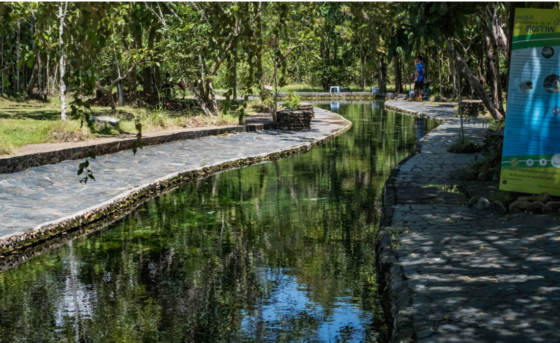
Kantang Hot Spring Forest Park (Bo Nam Ron Khuan Khaeng)

is located in Ban Khuan Khaeng, Mu 7, Tambon Bo Nam Ron, within the Pa Khao Wang, Pa Khuan Khaeng and Pa Nam Rap National Reserved Forest, it was declared a forest park by the Royal Forest Department on 9 June 2006. The Forest Park covers an area of around 500 rai. Geographically, it is a plain on the hillside with tropical rain forest and some swamp forest. There are 3 hot springs of which water temperatures are of around 70/40/30 degrees Celsius respectively. Foot soaking and a hot bath for health enhancement are available in private rooms, foot massage and traditional Thai massage, as well as sales of Thai massage and spa products using water from the hot springs as their main ingredients.