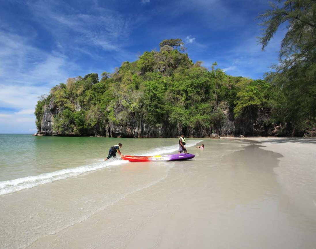
Hat Yong Ling

else are in great numbers. Many fishing villages are on the island. Most residents are Muslims. Homestay are available for tourists. From Ko Libong, one can get a good view of Hat Chao Mai and Chao Mai Cape.