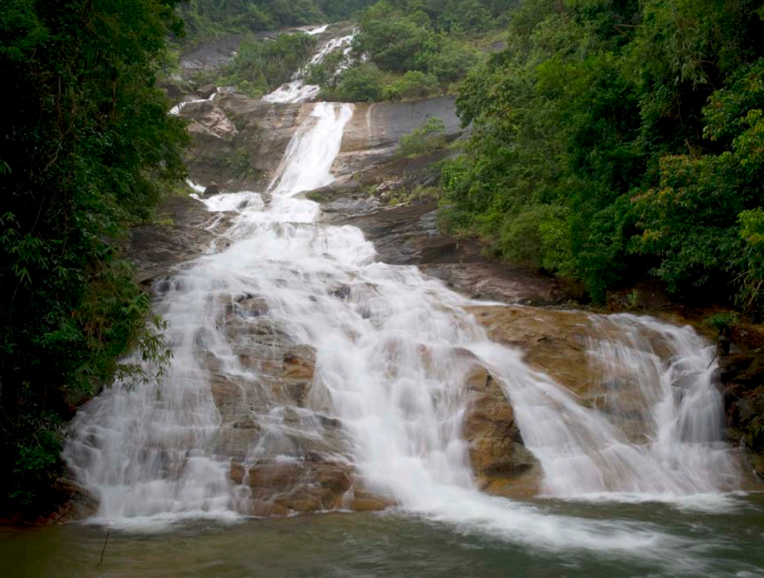
Namtok Ton Te

of about 50 metres high. On the ground level, visitors can enjoy swimming in a pool of water. This waterfall can be visited all-year round.