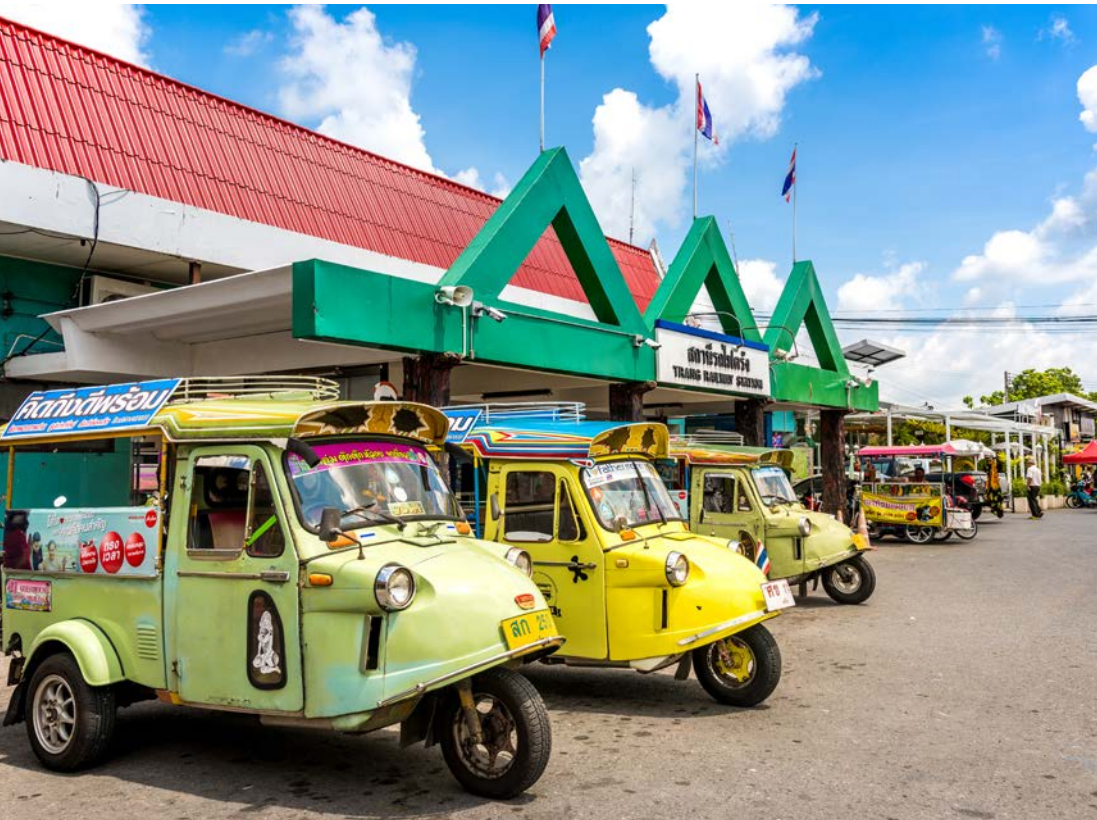
Tuk Tuk Hua Kop

-Relax in the Kaphang Surin Public Park and the Phraya Ratsadanupradit Mahison Phakdi Public Park.