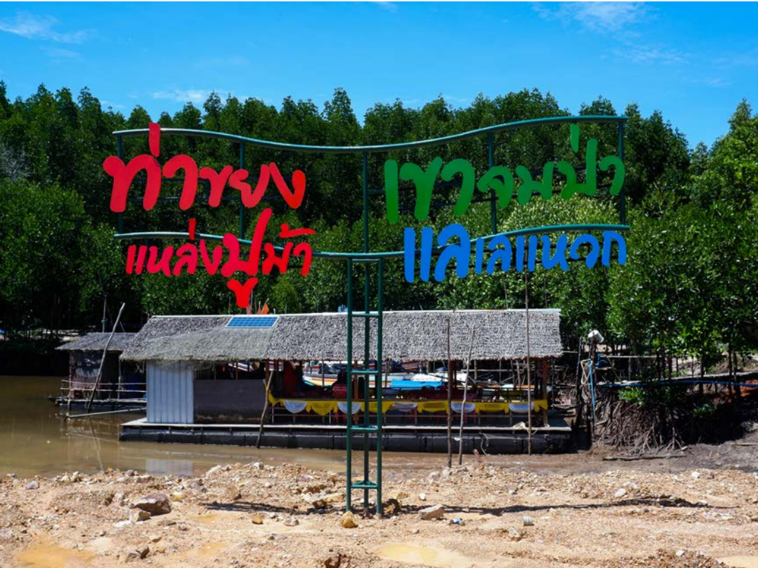
Ban Nam Rap Rafting

(วิวาห์ใต้สมุทร) The event is held on 13-15 February of every year. Activities in this unusual event include a welcoming ceremony for the brides and grooms (Thais and foreigners) at the Trang Airport, a bridal procession around town, and a dowry procession by long-tail boat. A wedding ceremony is performed on the beach by means of pouring blessed water from a conch shell onto the bridal palms and followed by underwater marriage registration at a depth of over 12 m. For