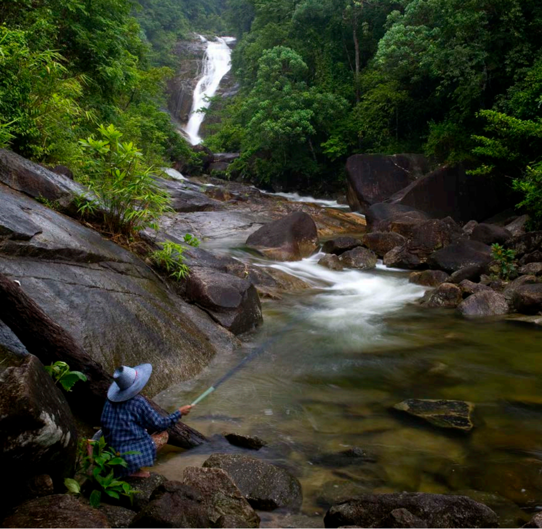
Namtok Sai Rung