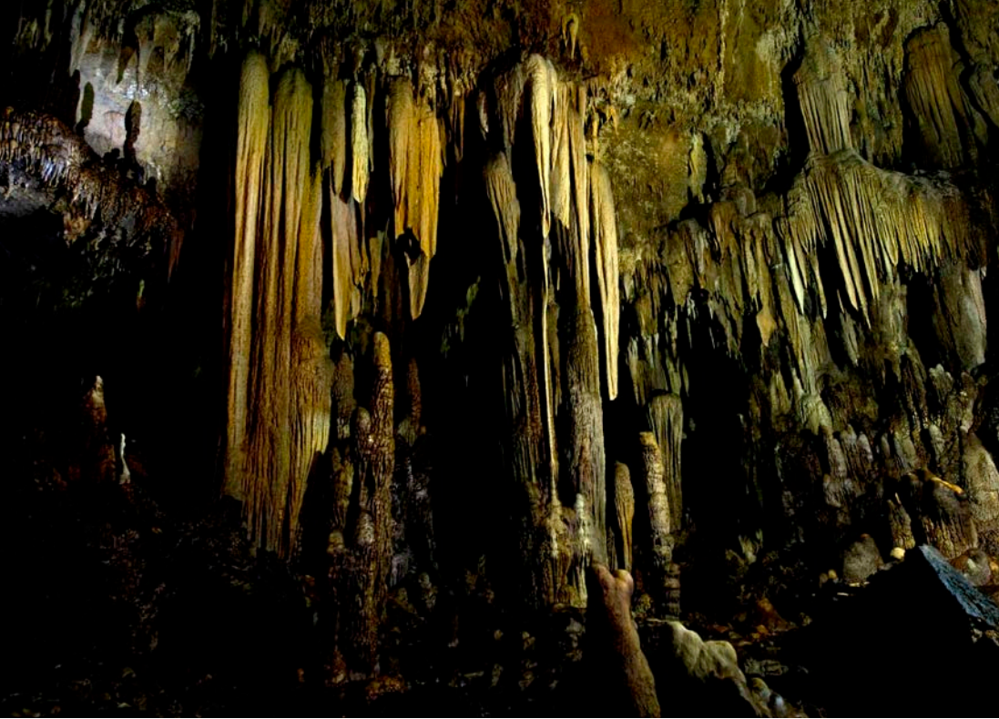
Tham Khao Chang Hai