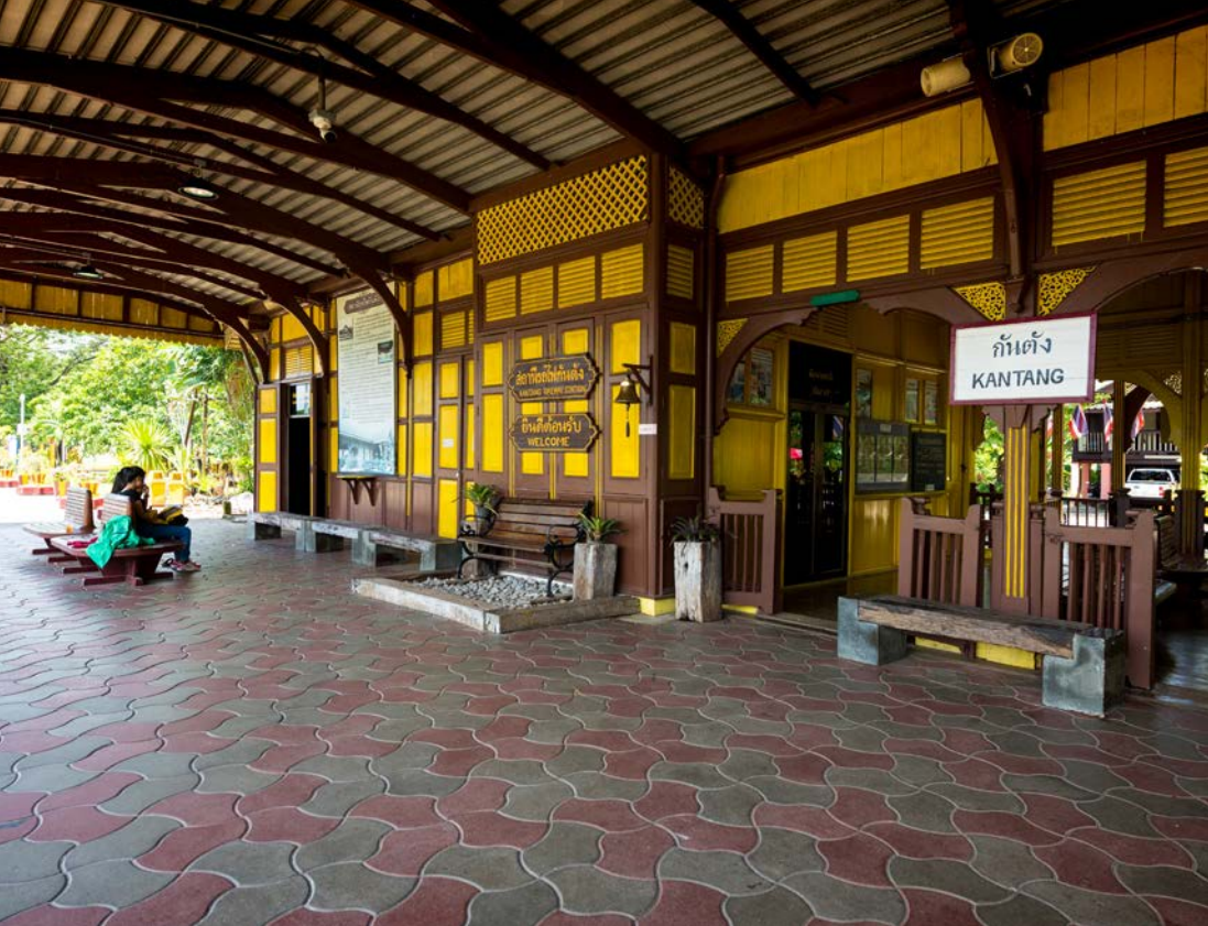
Kantang Railway Station

is the “old Trang lord’s house” or the house of Phraya Ratsadanupradit, the former lord of the province. The house is a two-story wooden building. Inside are a wax figure of the lord and a complete collection of his daily personal items. The Na Ranong family looks after the house. It is open to the public every day except Mondays.