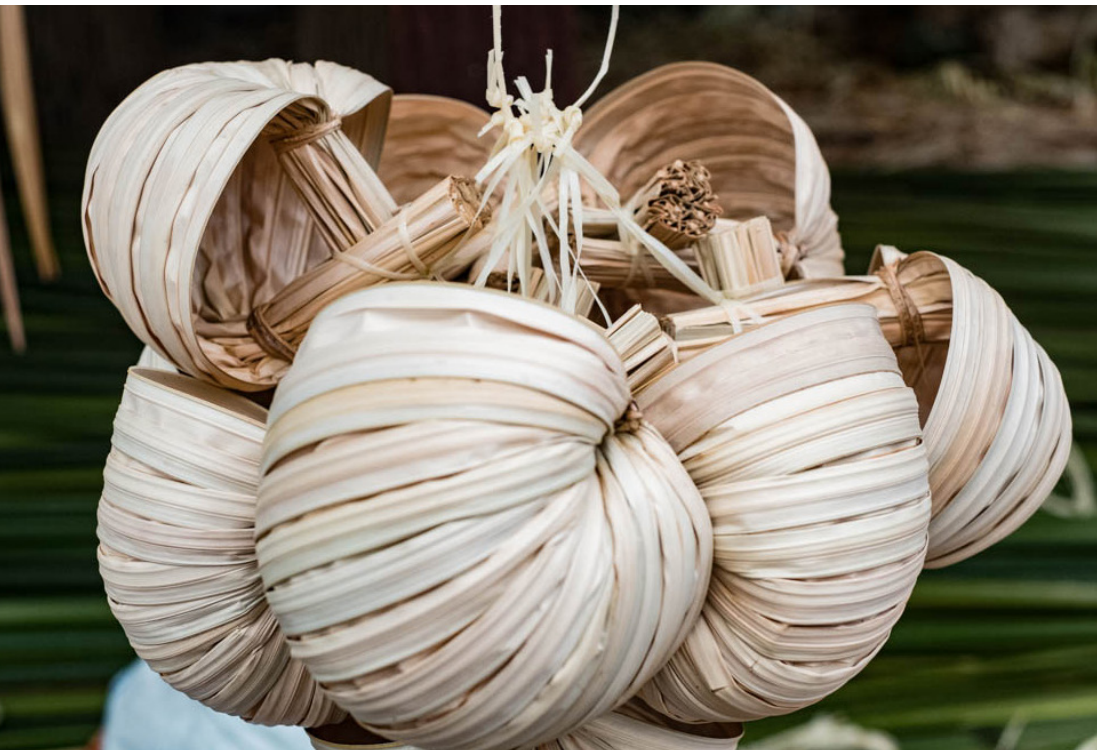
Ti-ma (water container) Ban Yan Sue Community

Toei Panan Basketry (จักสานเตยปาทัน) Ban Du Hun, Tambon Bo Hin, Amphoe Sikao, is made from screw pine or Toei Panan, which grows along the border of the mangrove forest in the Andaman area. It has special characteristics: being soft, strong, durable, and not contaminated