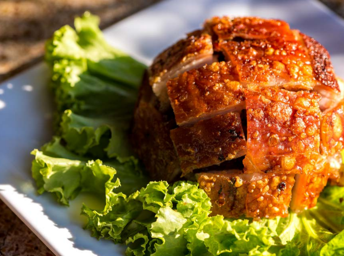
Trang's Roasted Pork

Tha Pap Intersection and turn left to follow the Thetsaban 6 Road (Highway No. 1021) for about 4 Kilometres before reaching the Enterprise Group of Na Muen Si Woven Textile.