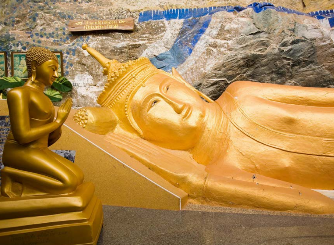
Phra Non Song Khruang Nora