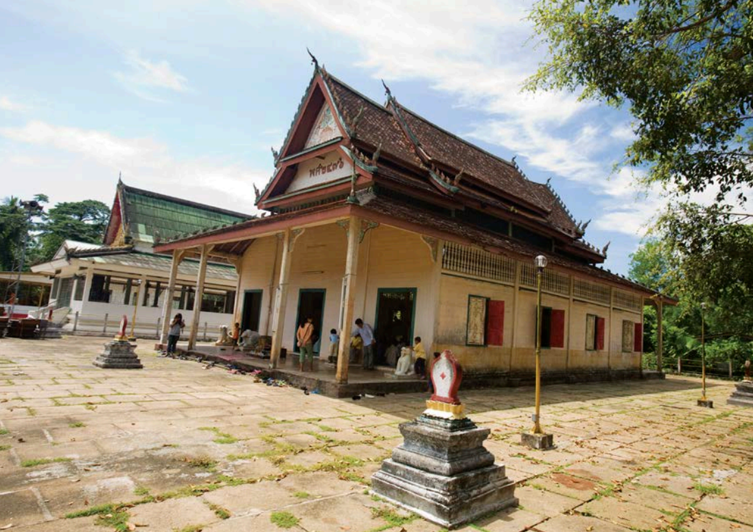
Wat Trang Khaphum Phutthawat