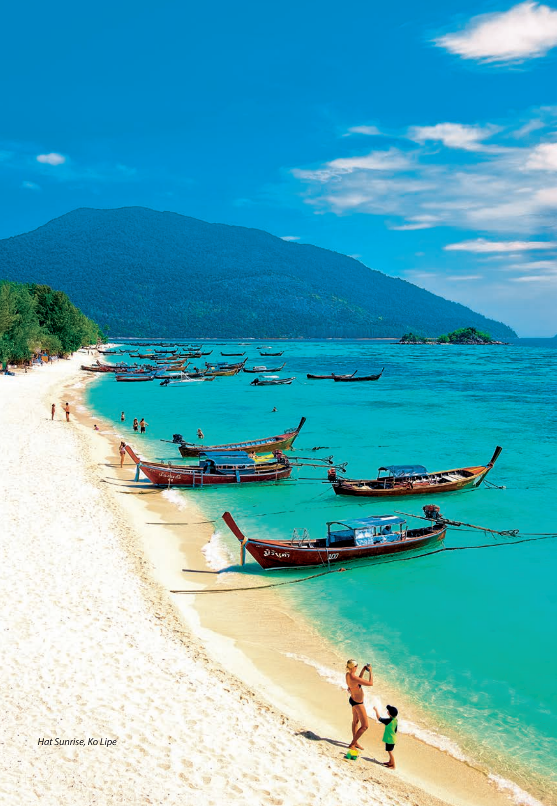
Hat Sunrise, Ko Lipe