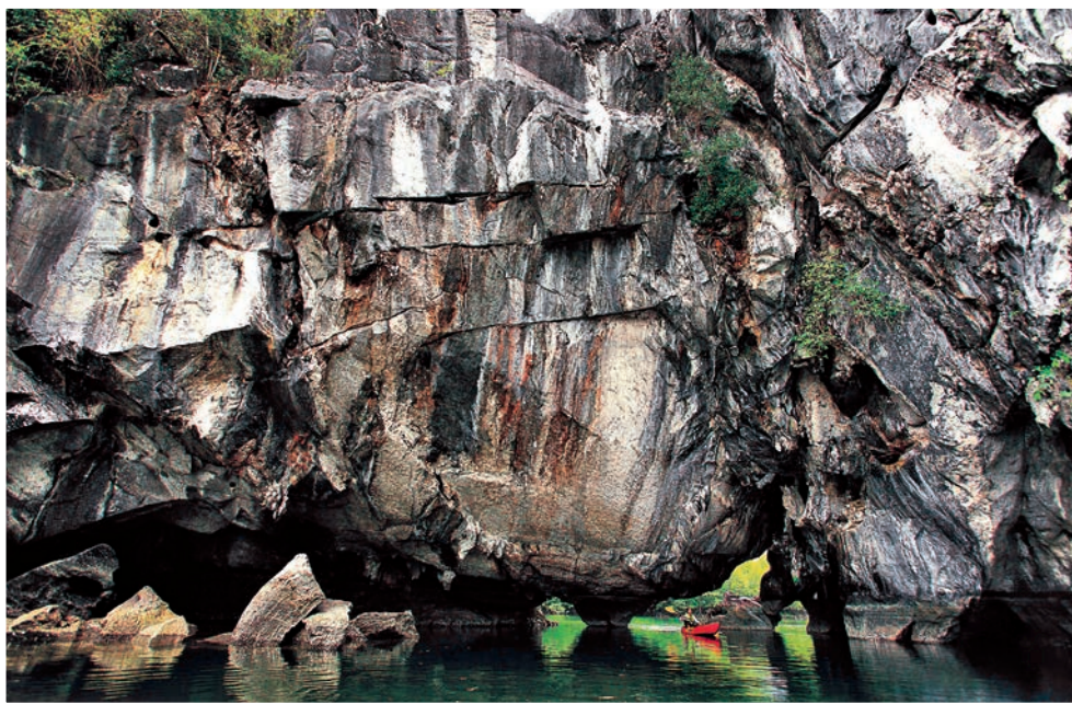
Tham Lot Puyu