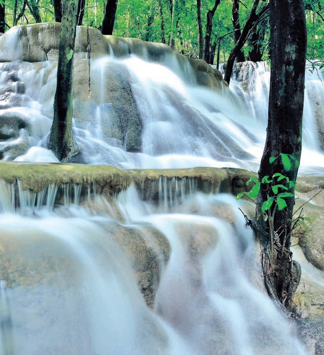
Namtok Wang Sai Thong

Amphoe Thung Wa's Tambon Khon Khlan in Satun and Amphoe Palian's Tambon Sukon in Trang. Most of the areas are high and steep mountains with valley plains and beaches. The total area both on land and in the sea is about 494.38 sq km. It was declared a national park