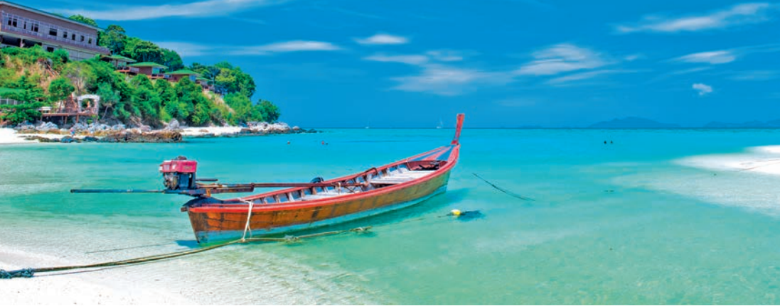
Ko Sipe or Ko Lipe

Ko Rawi (เกาะราวี) It is located just one kilometre from Ko Adang. This island has an area of about 29 sq km, with a beautiful beach, crystal clear sea, and serenity. It is the location of the Tarutao National Park Ranger Station To 6 (Hat Sai Khao). There is no accommodation on the island. Visitors usually come here to enjoy swimming and diving on the coral reef.