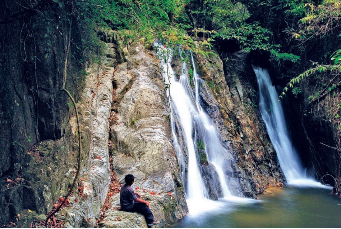
Namtok Ya Roi

shellfish. Around the lake are Bakong plants ( Hanguana malayana ), which grow densely. The park provides lakeside pavilions for visitors' recreation, as well as a wooden path around the lake.