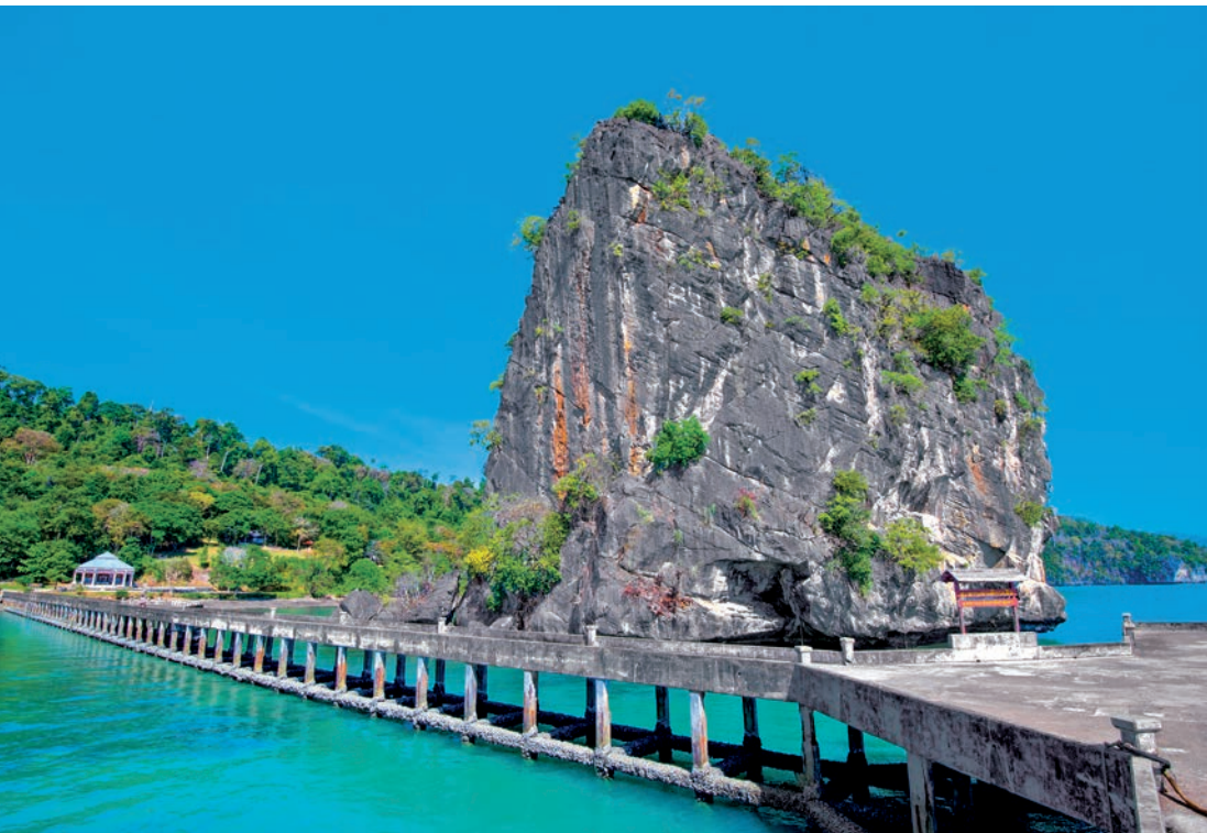
Ao Talo Wao

Ao Talo Wao (อ่าวตะโลงวาว) It is a bay located to the east of the island, and provides another viewpoint for a beautiful sunrise. The Park's Ranger Station To To 1 (Talo Wao) is situated here. It is a historical area where the reformatory estate for detention and critical prisoners was established. Nowadays, the park has imitation buildings of the past, such as houses