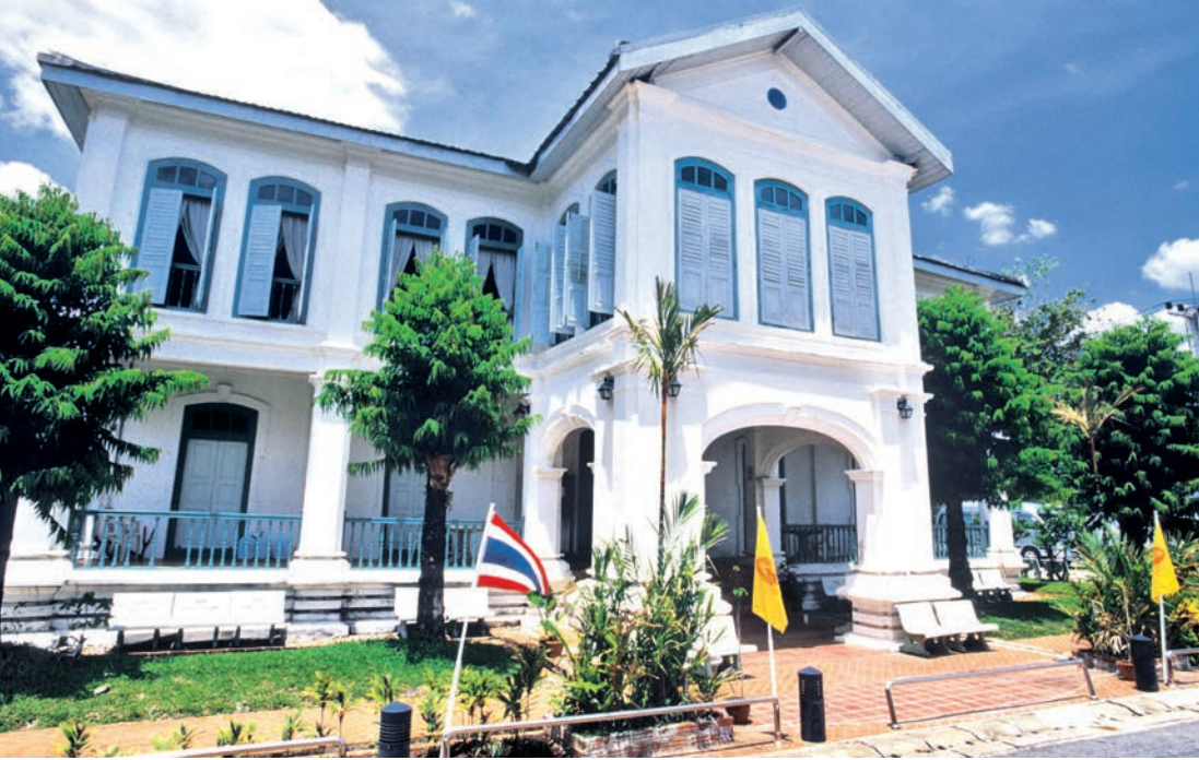
Satun National Museum–Kuden Mansion

residence during a royal visit of King Rama V to the South. However, the king did not stay overnight here. The building was later used as an official residence and as the Satun Town Hall. Until WW II in around 1941, the building was occupied by Japanese soldiers as their command unit. It was also used as the Satun City Hall and other important official places. During 1997–2000, the Fine Arts Department renovated the Kuden Mansion into a western two-storey brick building. Curved doors and windows are in the European architectural style of art. Its Thai-styled hip-roof is covered with Spanish terra cotta roof tiles. Window panels consist of wooden shutters. The top of the pediment is adorned with a star-shaped vent in accordance with Islamic architecture.