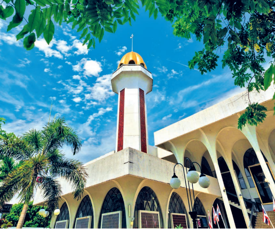
Satun Central Mosque or Mambang Mosque