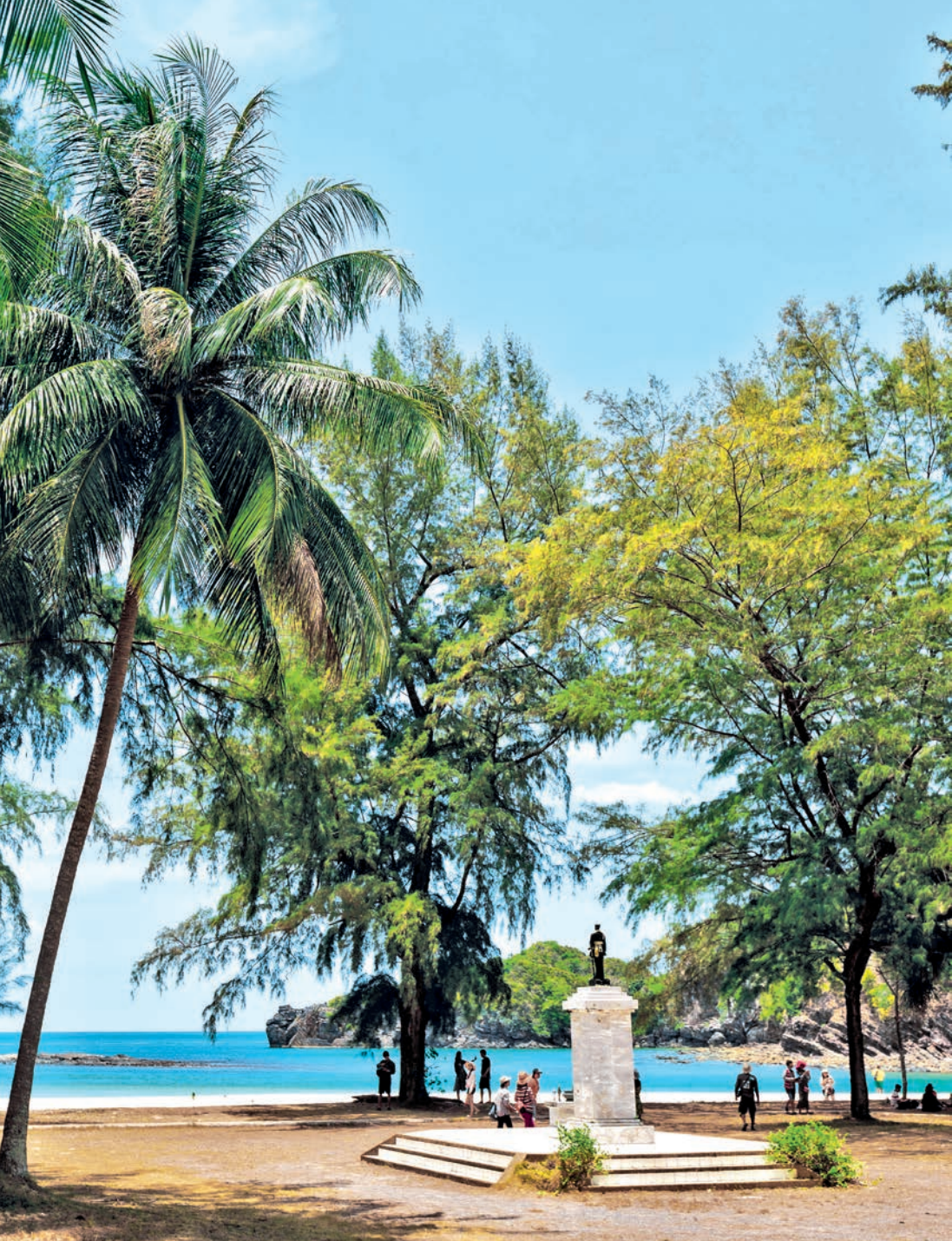
Ko Tarutao, Tarutao National Park