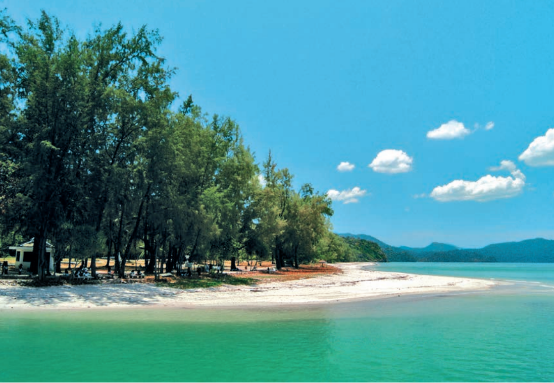
Ao Phante Melaka

of the warders, a sleeping hall of prisoners, an occupational training centre, a cemetery of 700 corpses, etc., constructed in the area.