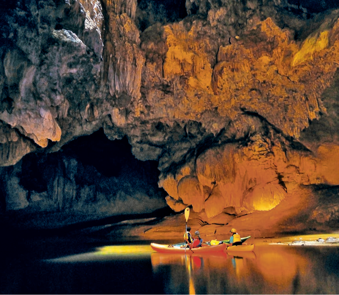
Tham Chet Khot

each of its tiers. It is shady around the waterfall area, which makes it suitable for recreation.