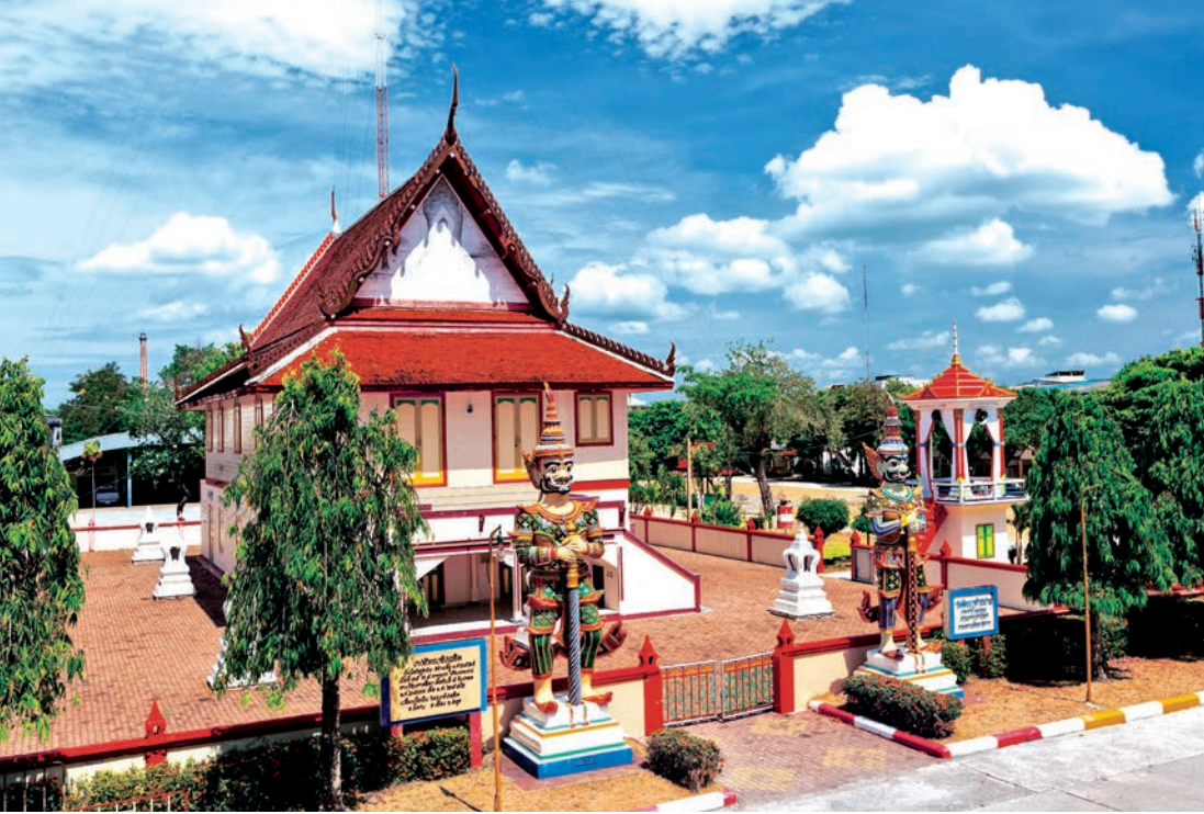
Wat Chanathip Chaloem

plants make the park shady and suitable for recreation. Food shops are available in neighbouring areas.