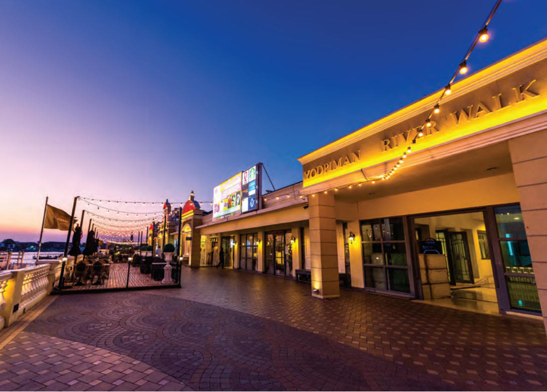
Yodpiman River Walk

Kanlayanamit, and Wat Arun Ratchawaram or Temple of Dawn, the 300-metre-long walking corridor along the Chao Phraya River, and the jetty.