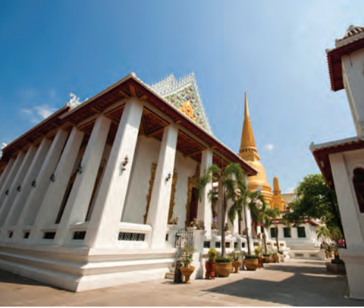
Wat Bowon Niwet Wihan

Paintings on the columns of the ordination hall , which convey the mind of a person from being in the (dark) black to (bright) white states.