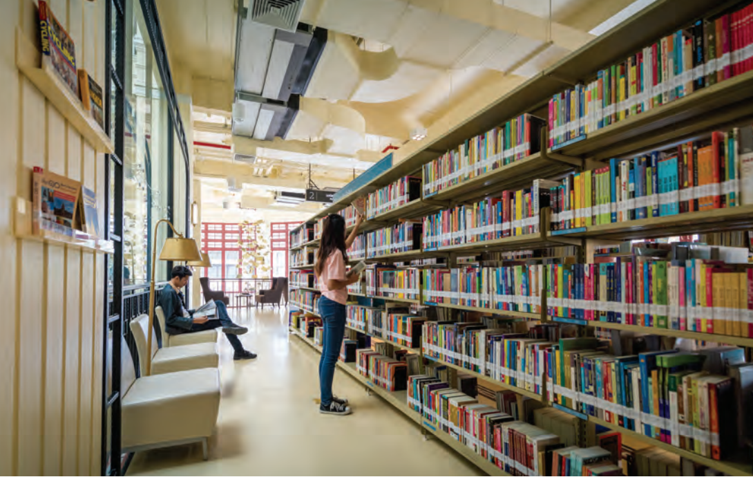
Bangkok City Library