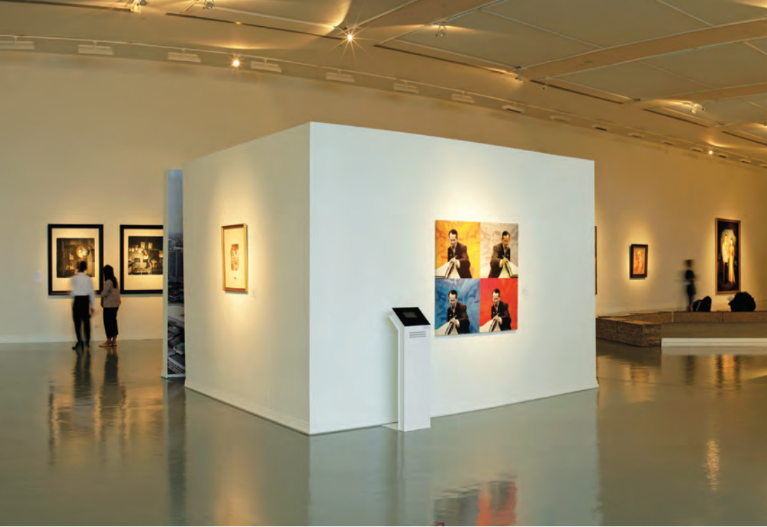
Bangkok Art and Culture Centre

Tel. 0 2245 3008, 0 2245 4532 www.bangkokdolls.com