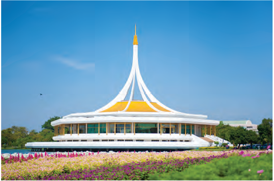
Suan Luang Rama IX

the Royal Thai Government and the general public to mark the auspicious occasion of the sixth cycle birthday anniversary of His Majesty the King on 5 December, 1999. The spacious area provides a pleasant atmosphere as well as a scenic view of the Chao Phraya River and the Rama VIII Bridge. It is popular among both Thais and foreigners, especially from the nearby Bang Lamphu community.