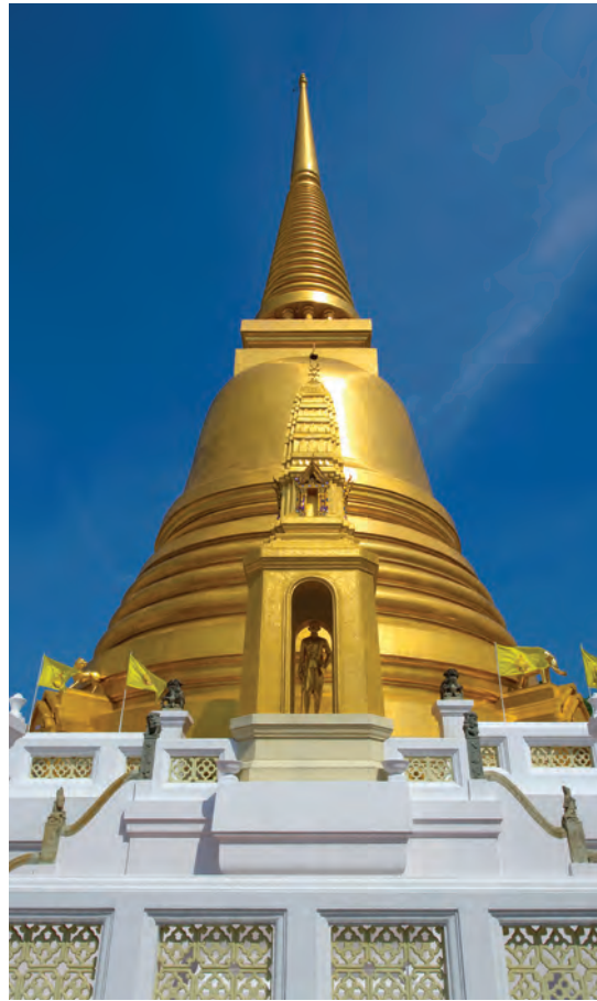
Phra Maha Chedi

Phra Wihan Phra Satsada or the image hall of the founder of Buddhism, which houses a bronze Buddha image in the posture of subduing Mara and a bronze reclining Buddha image of the Sukhothai Period.