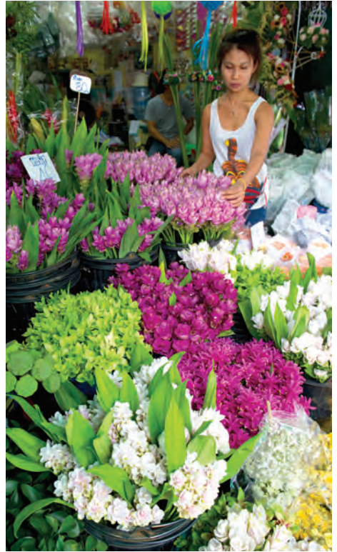
Pak Khlong Talat

pearl inlay. It is located near Charoen Krung and Yaowarat Roads. Handcrafted products are available :