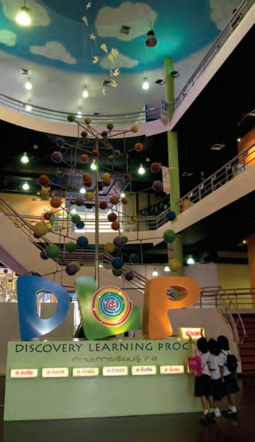
Children's Discovery Museum

operational site and equipment of the post office in the past, providing services of postal money orders, selling stamps, etc. In front of the building, Thai postal boxes in various periods, as well as, those from foreign countries are exhibited.