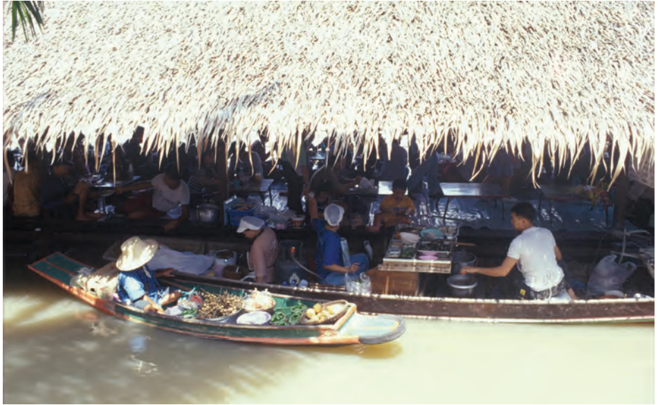
Taling Chan Floating Market

Sunday, and consecutive public holidays with Saturday-Sunday from 8.00 a.m.- 5.00 p.m. Canal tour by boats on 4 routes are in service in which visitors can buy tickets and take a boat at the Market.