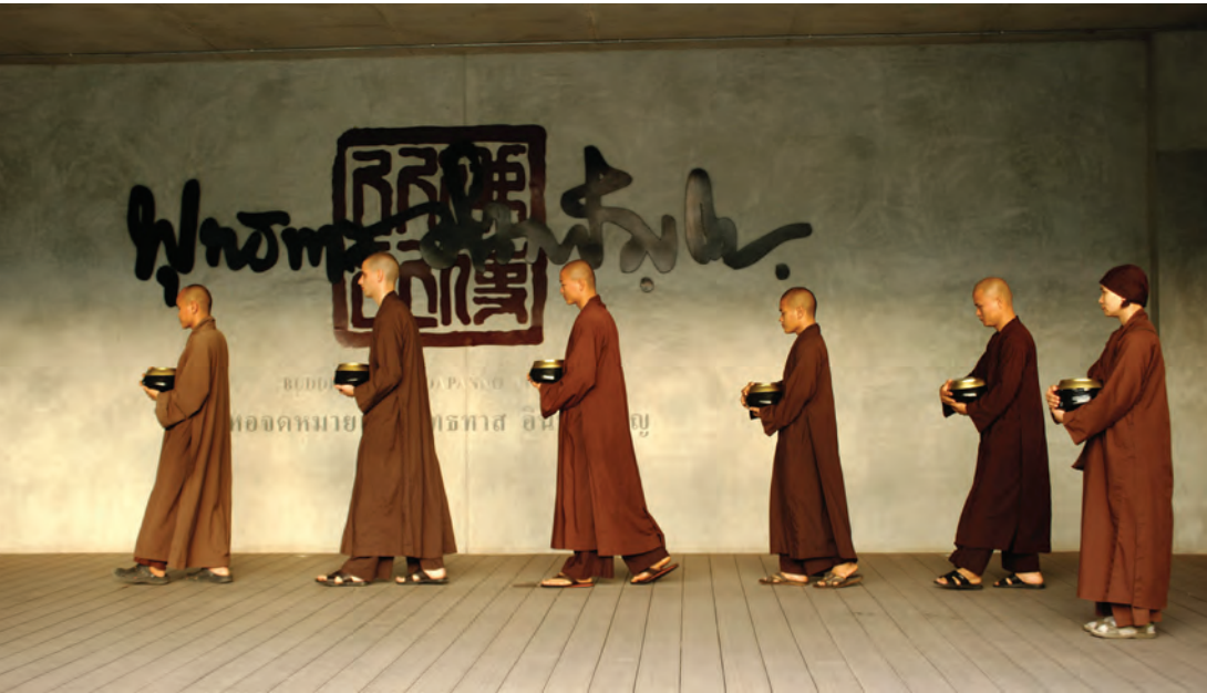
Buddhadasa Indapanno Archives

Thai cooking class is also arrange by many hotels including :