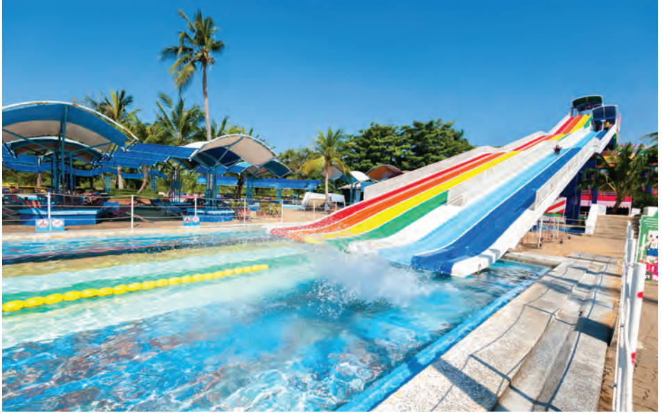
Siam Park City