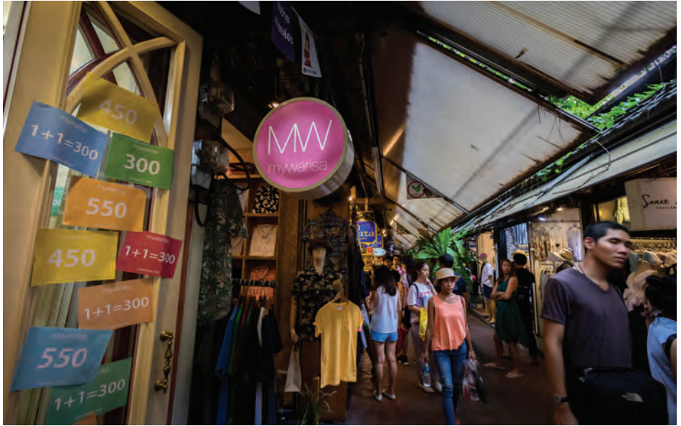
Chatuchak Weekend Market

shopping places such as Ban Mo Jewellery Street, Yaowarat Road The 1.5-km-long road offers a variety of food, sweets, fresh fruits, and fruit juice. Also, there are markets selling fresh food and ingredients, and sales of Chinese costumes in different colours.