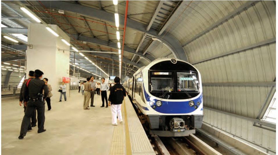
Airport Rail Link

As the political, economic, cultural and culinary capital of Thailand, Bangkok features both old-world charm and modern convenience, at times served up in an apparently chaotic manner, but always with a gracious smile. Bangkok exceeds 1,500 square kilometres in area and is home to one-tenth of the country's population.