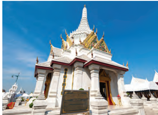
The City Pillar Shrine

According to an old Thai tradition, a city pillar had to be built upon the establishment of a new city. King Rama I had the Bangkok city pillar erected near the Temple of the Emerald