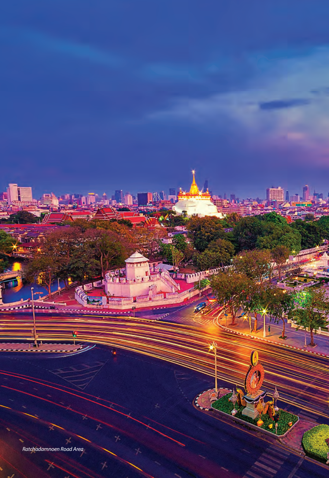
Ratchadamnoen Road Area