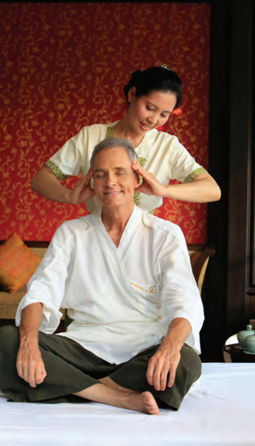
Thai Traditional Massage

music, Edutainment, arts, photography practice, Yoga and Tai Chi.