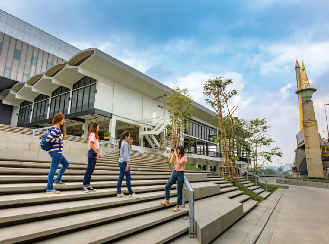
Bank of Thailand Museum

Tel. 0 2256 7766, 0 2283 6152 www.bot.or.th