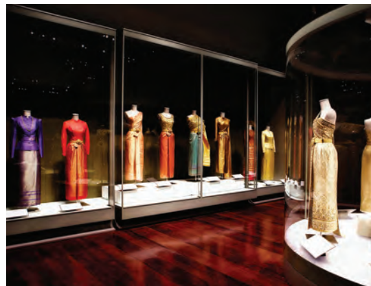
Tradition Thai Costumes

Located at the Ratsadorn-bhibhathana Building in the Grand Palace, was established according to Her Majesty Queen Sirikit's initiative with the purpose of disseminating and promoting knowledge of the art wisdom, culture, costumes, and textiles to be a sustainable