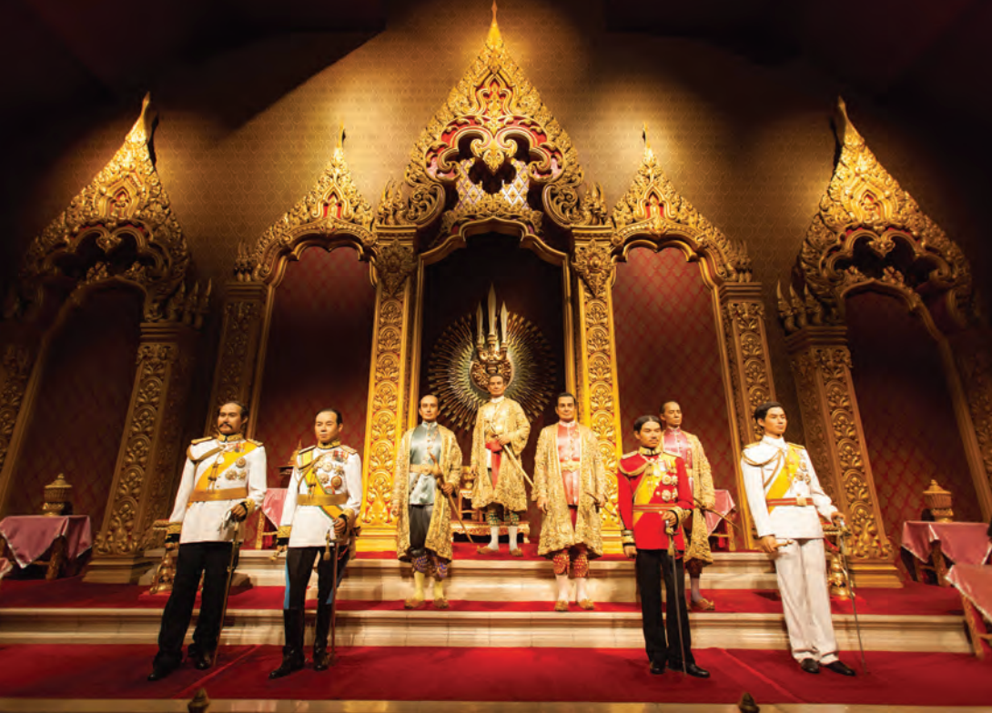
Thai Human Imagery Museum

Admission : Adults 300 Baht, child 150 Baht Tel. 0 3433 2109, 0 3433 2607, 0 3433 2601