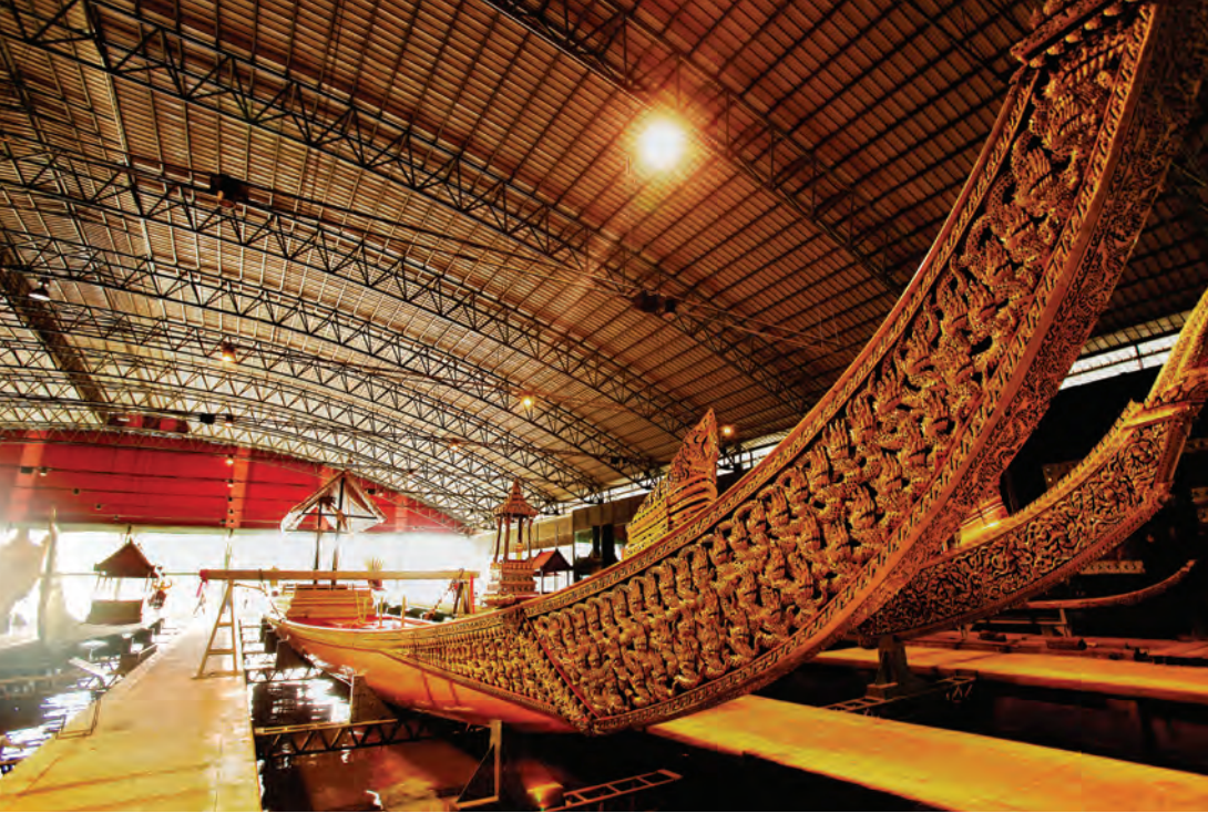
Royal Barge National Museum