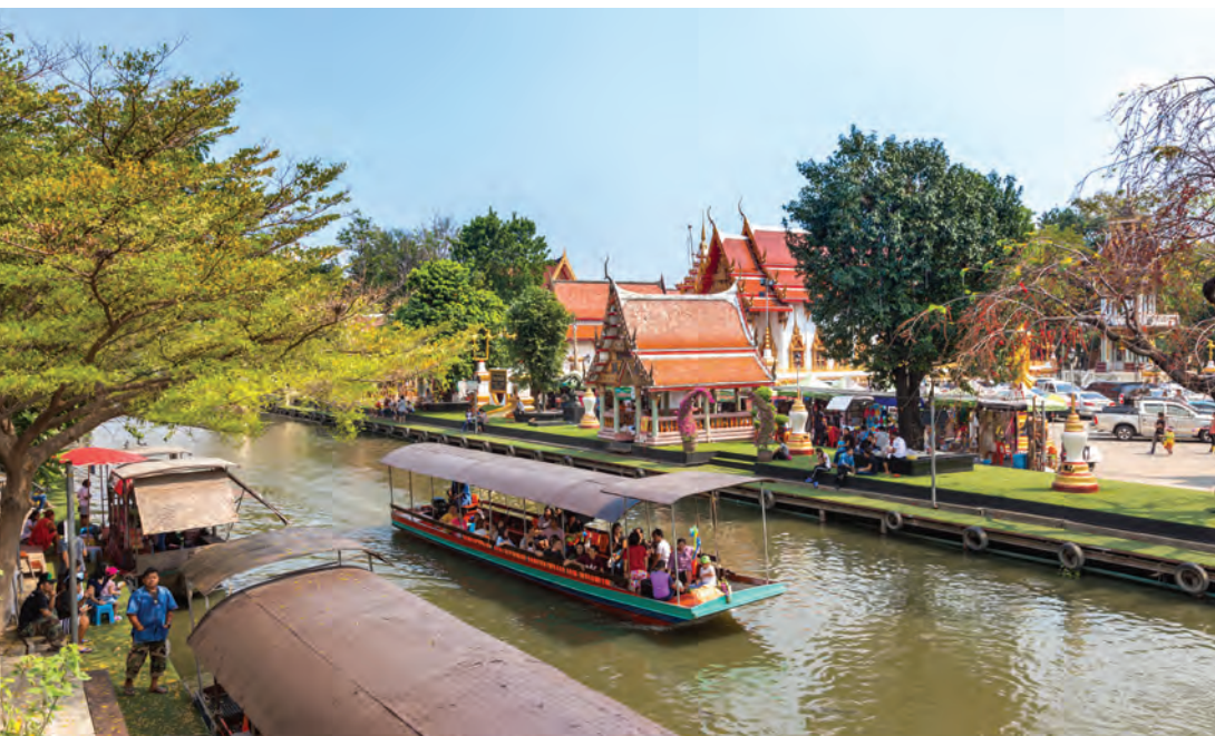
Kwan-Riam Floating Market

Details of current programmes and events can generally be found in Bangkok's major English-language newspapers, namely Bangkok Post and The Nation. www.bangkokpost.com or www.nationmultimedia.com