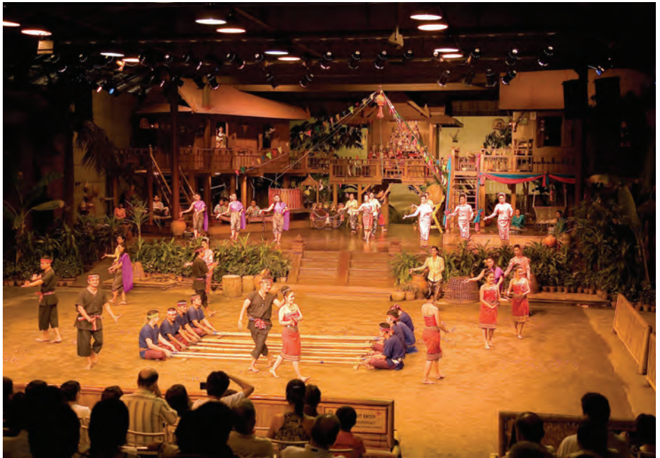
Suan Sampran Riverside Rose Garden

Open : daily from 09.30 a.m.-05.30 p.m. (week-days), 08.30 a.m.-06.00 p.m. (Weekends and public holidays)