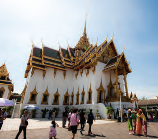
Phra Thinang Dusit Maha Prasat