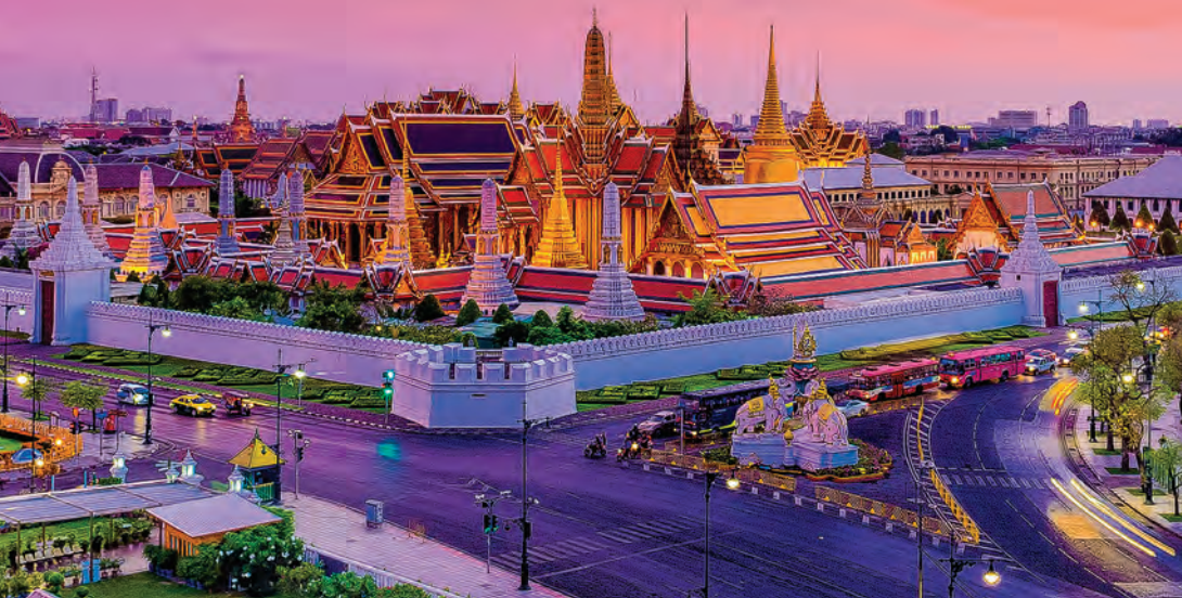
The Grand Palace and Wat Phra Kaeo

Bus A regular bus service is provided by the Bangkok Mass Transit Authority (BMTA) and its contracted operators throughout Bangkok as well as to its outskirts during 04.00 a.m.-11.00 p.m. and around the clock on certain routes. Public buses are plentiful and cheap, with a minimum fare of 8,10 Baht to most destinations within metropolitan Bangkok. Air-conditioned buses have minimum and maximum fares of 15-25 Baht, respectively. A Bus Route Map is available at bookshops. For more information, please call 1348.