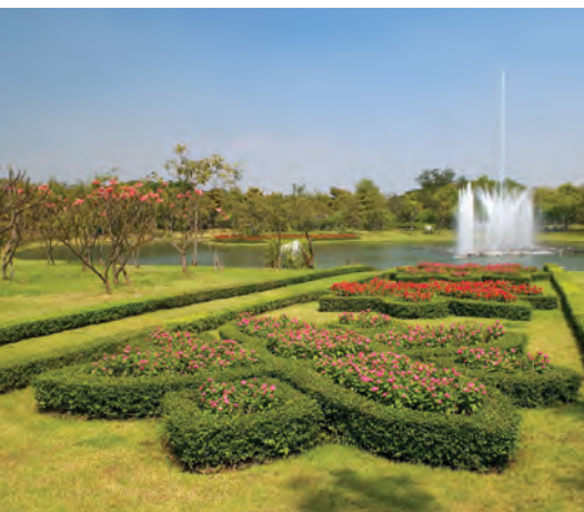
Queen Sirikit Park