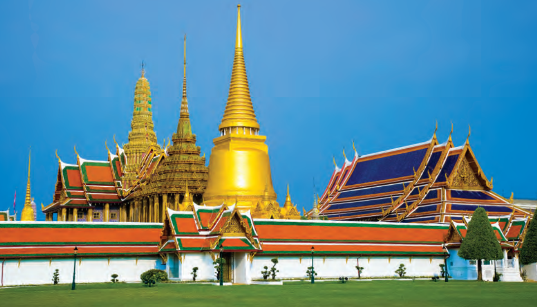
Wat Phra Kaew

interesting structures include a group of 8 Prang towers, Phra Si Rattana Chedi, model of Angkor Wat, Prasat Phra Thepbidon, etc.