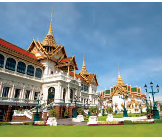
Phra Thinang Chakri Maha Prasat

reigns of King Rama IV and King Rama V. Major throne halls include: