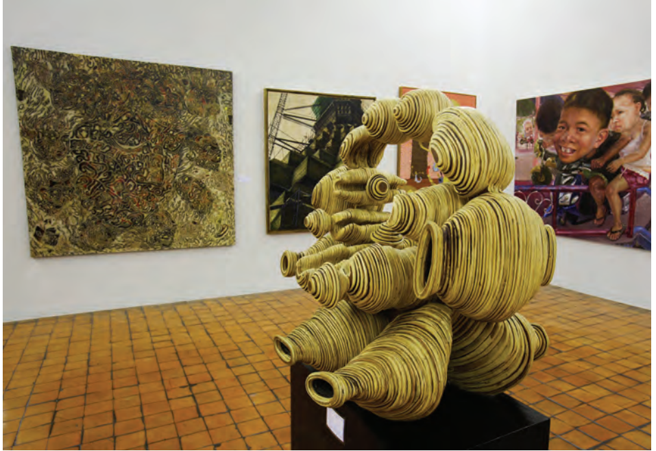
National Gallery Museum

Thinang Itsara Winitchai. In the reign of King Rama V, a national museum was first established at the Concordia Hall and known as “Miosiam” before being transferred to where it is now located. Currently, the second king’s palace also houses Thammasat University, Bangkok Fine Arts College, Bangkok Dramatic Arts College and National Theatre. The complex also accommodates Wat Bowonsathan Suttawat otherwise known as Wat Phra Kaeo Wang Na. The National Museum exhibits a large variety of antiquities and objets d’art, which represent the cultural heritage of Thailand and neighbouring countries. The Bangkok National Museum won the Award of Excellence in the category of Tourism Promotion Organisations and Projects of the Thailand Tourism Awards 2002 from its