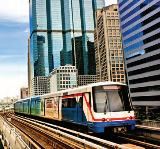
BTS Sky Train