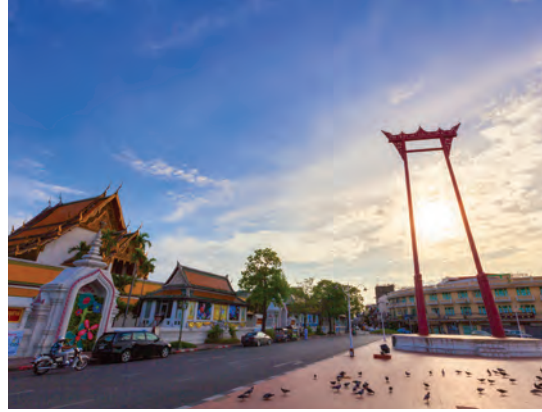
Wat Suthat and the Giant Swing

Situated to the north of Saran Rom Park. It was built in the reign of King Rama IV who intended it to be a temple in the Dhammayutika Sect as well as to be one of the 3 major temples as required by an old tradition to be situated within the capital. The place was originally a royal coffee plantation in the reign of King Rama