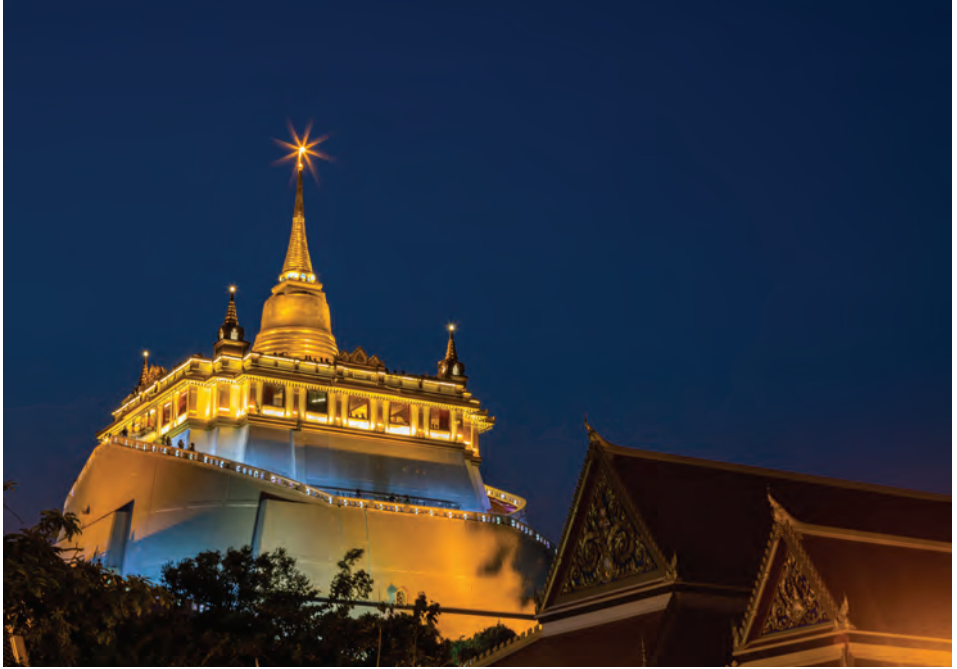
Wat Saket and the Golden Mount