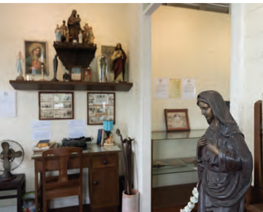
Ban Kudi Chin Museum

of the Khok Wua Intersection, nearby Bang Lamphu district, the Library is in an old three-storey building by the roadside of Ratcha damnoen Klang Avenue. It serves as a public library, which consists of spaces for rotating