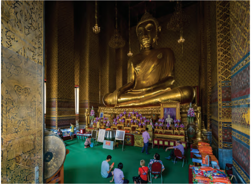
Wat Kanlayanamit Woramahawihan

Santa Cruz Church , which is a Roman Catholic church of neoclassical architecture of the Renaissance.