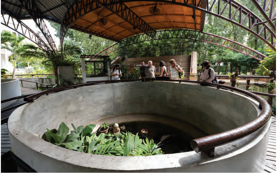
Queen Saovabha Memorial Institute (Snake Farm)

To get there: Take a boat from Atsadang Pier at Pak Khlong Talat to the Wat Kanlayanamit Pier or the Kudi Chin Community.