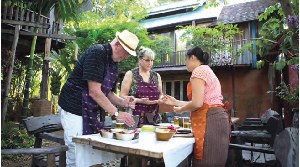
Thai Cooking School

BaiPai Thai Cooking School (โรงเรียนสอนทำอาหารไทยใบพาย) Ngam Wongwan Soi 54 Road, Chatuchak Tel. 0 2561 1404 www.baipai.com