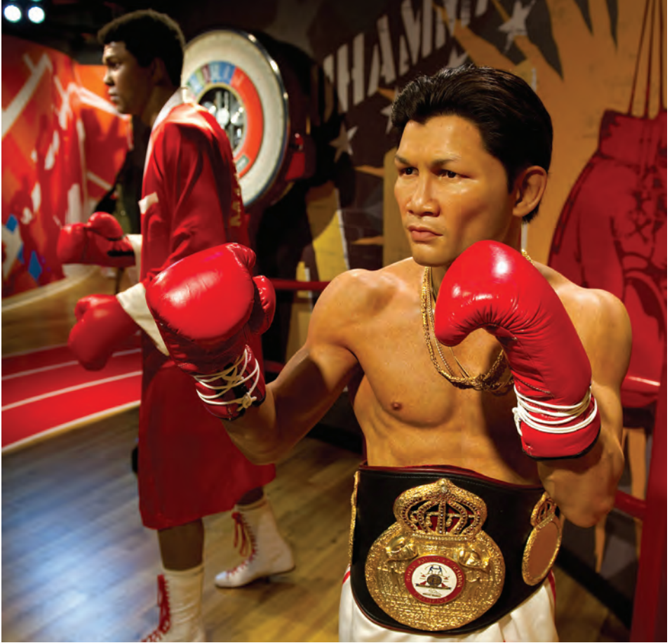
Madame Tussauds Bangkok

the private sectors. It is intended as a venue for cultural exchange in terms of content, curatorial and cultural management, giving Bangkok an operational base on the international art scene.