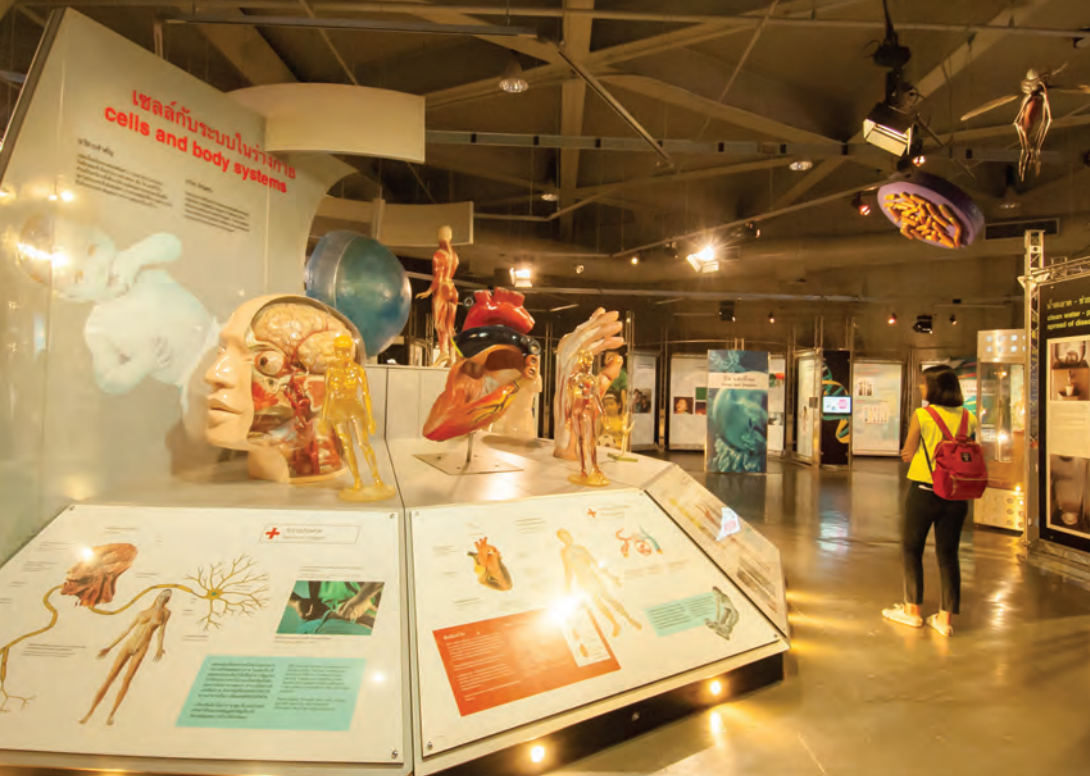
National Science Museum Thailand