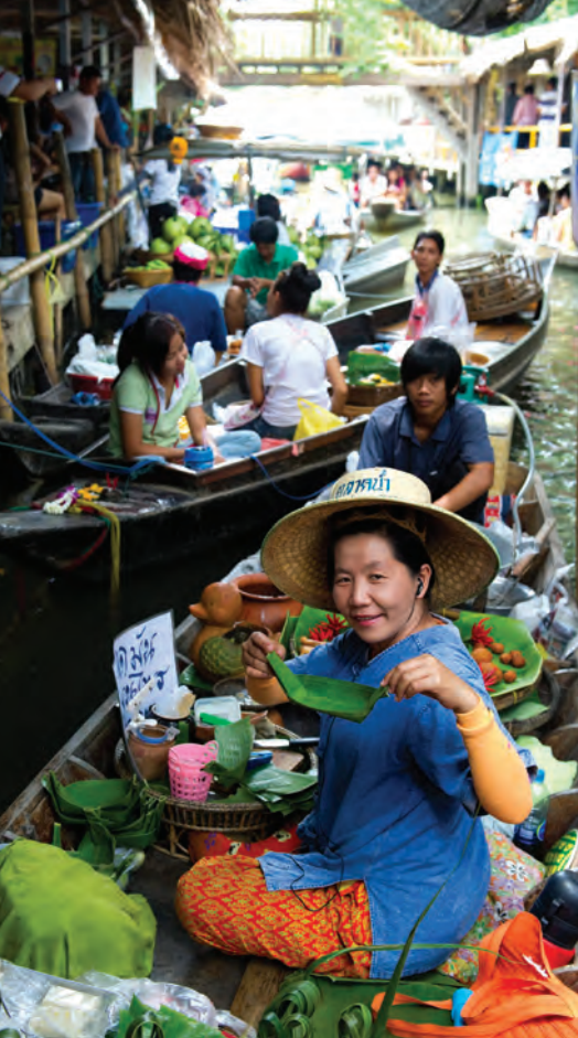
Khlong Lat Mayom Floating Market

an ancient temple since the Ayutthaya period as evidenced from the discovery of a sandstone Buddha image and the three other Buddha images: Luangpho To, Luangpho Klang, and Luangpho Dam. The Market offers a variety of food and desserts including fresh fruits and vegetables from gardeners.