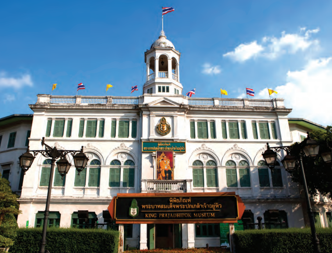
King Prajadhipok Museum

political reform, promulgation of the constitution, royal utensils and memorabilia, as well as his life after abdication and death in the United Kingdom.