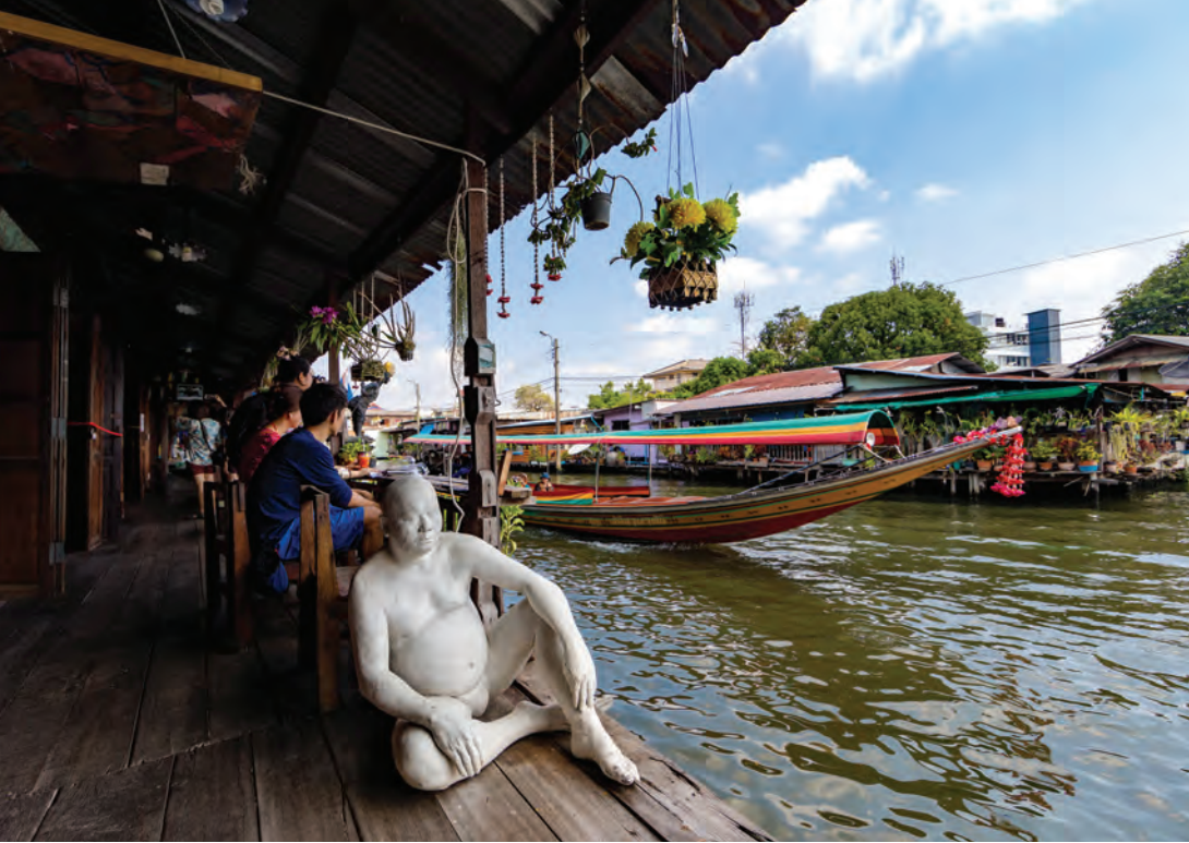
Klong Bangluang Artist's House

products to visitors who come to admire the authentic atmosphere of the community's way of life at Khlong Bang Luang. Moreover, there is the Klong Bangluang Artist's House, a wooden house in the Manila style with an L shape body. In the house's courtyard is compounded an old pagoda, which was presumably a pagoda marking one of the four directions of Wat Kamphaeng. On the upper floor is a gallery displaying artworks, drawings, and photographs. Downstairs sells souvenirs and art postcards. Art teaching classes, especially jewellery class are offered every Sunday. Furthermore, visitors can enjoy a performance of puppetry by the Kum Nai Hun Lakon Lek (Puppet Troupe) one more show is available on Wednesday, Friday-Sunday at 02.00 p.m. except for Monday-Tuesday and Thursday.