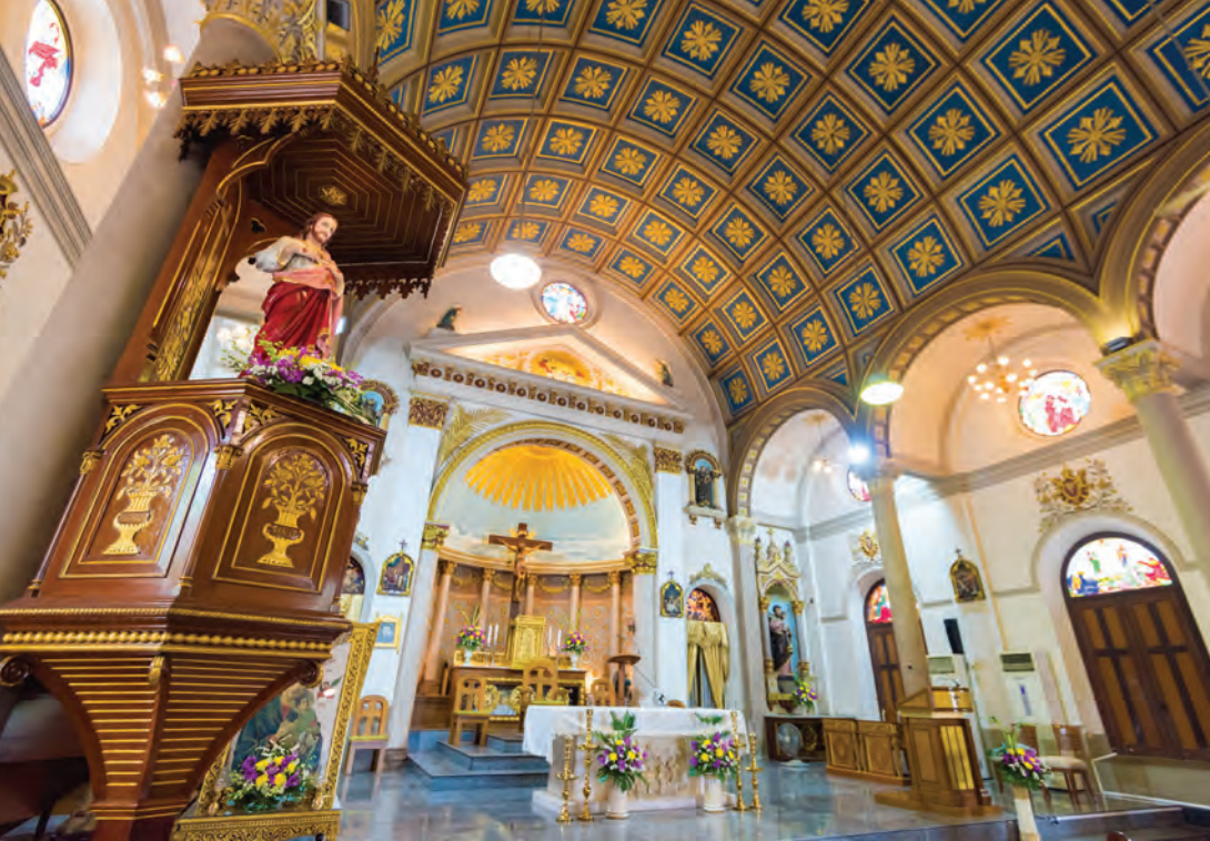
Santa Cruz Church