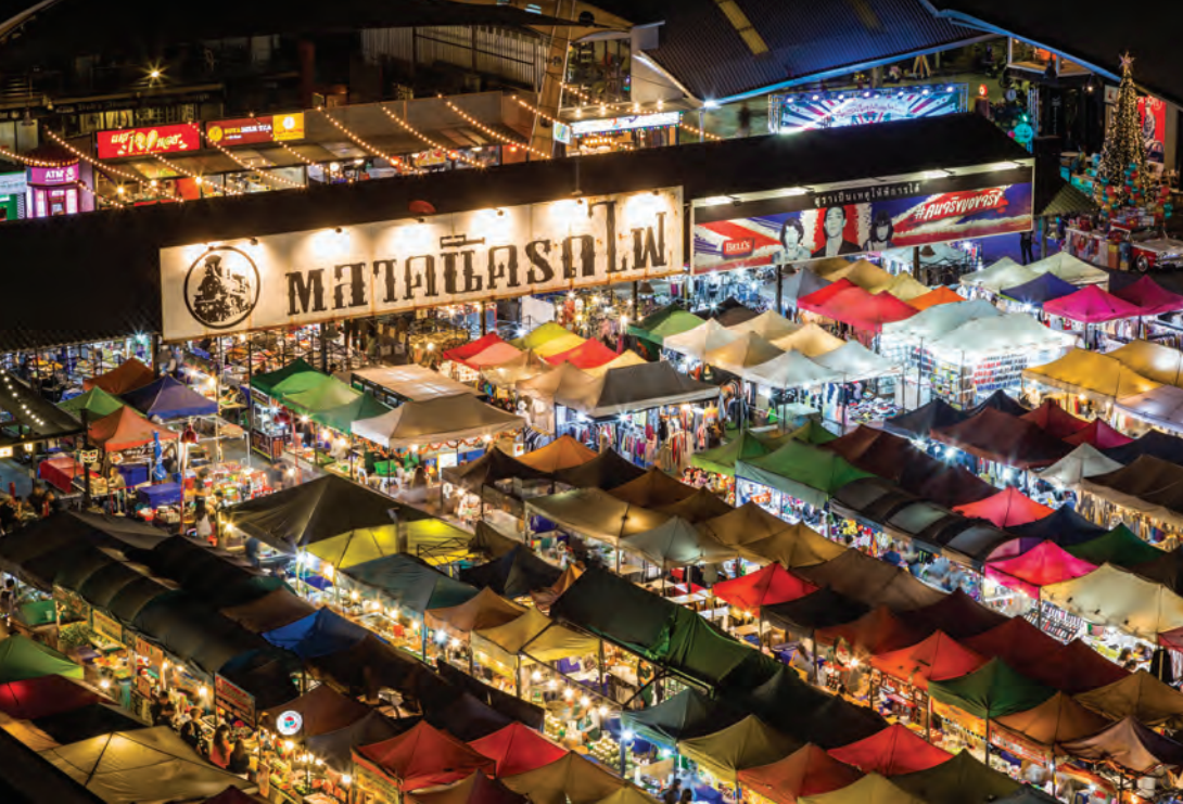
Train Night Market Ratchada

Dairy Queen 280/seat (A la carte) boat leave King Rama III Bridge pier Tel : 0 2921 8670-5