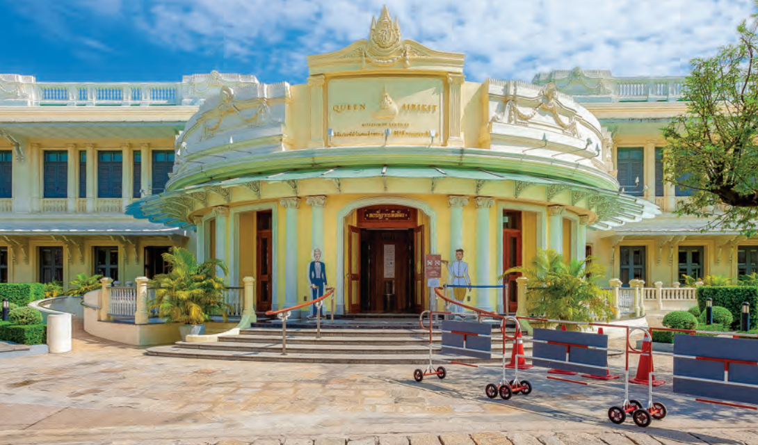
Queen Sirikit Museum of Textiles

Road, was built in 1901 with two storeys stucco. The interior is decorated in Muslim style with wooden craft. They are some religious leader from other country had visited. The mosque warmly welcomes all visitors.