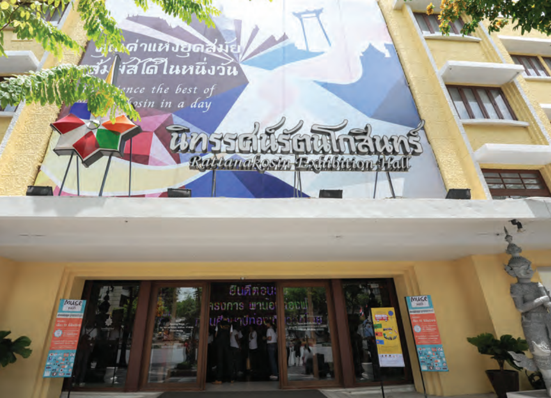
Rattanakosin Exhibition Hall

Open : Tuesday- Sunday from 09..00 a.m.-07.00 p.m.