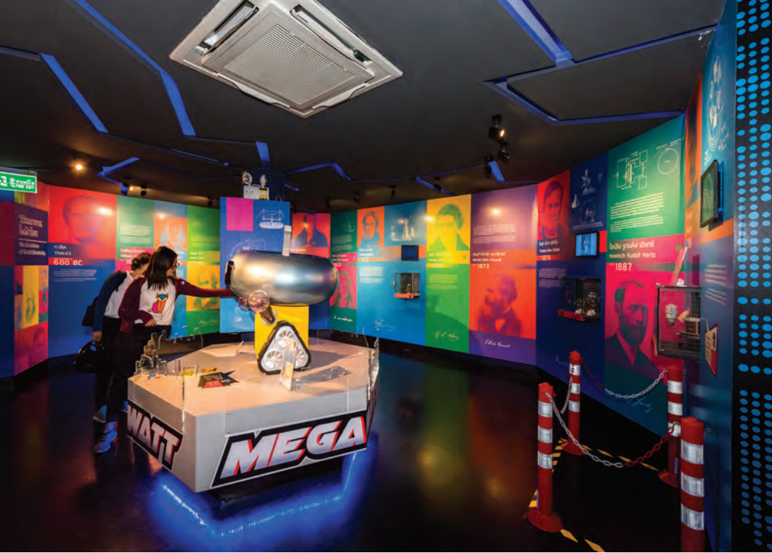
Science Centre for Education

Tel. 0 2247 0028 ext. 4142, 4206, 4207, 4224