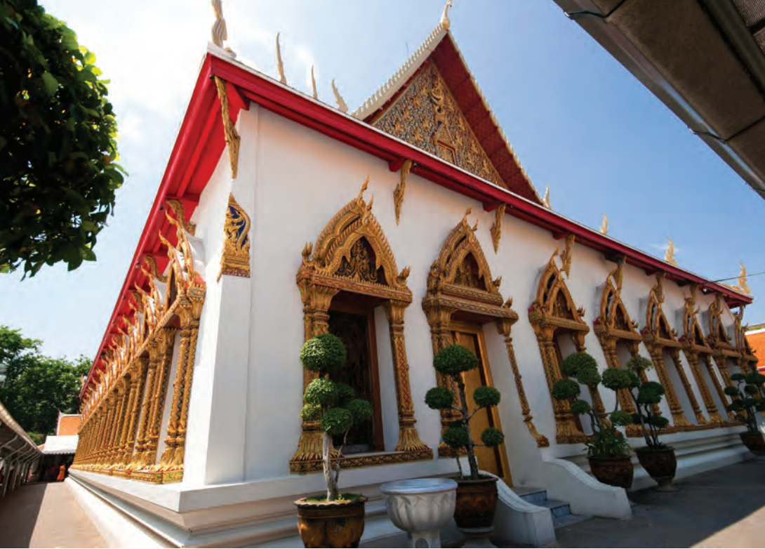
Wat Chana Songkhram Ratchaworamahawihan