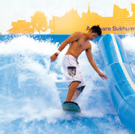
Flow House Bangkok

od, Cool drinks, Perfect waves ...Everyday!