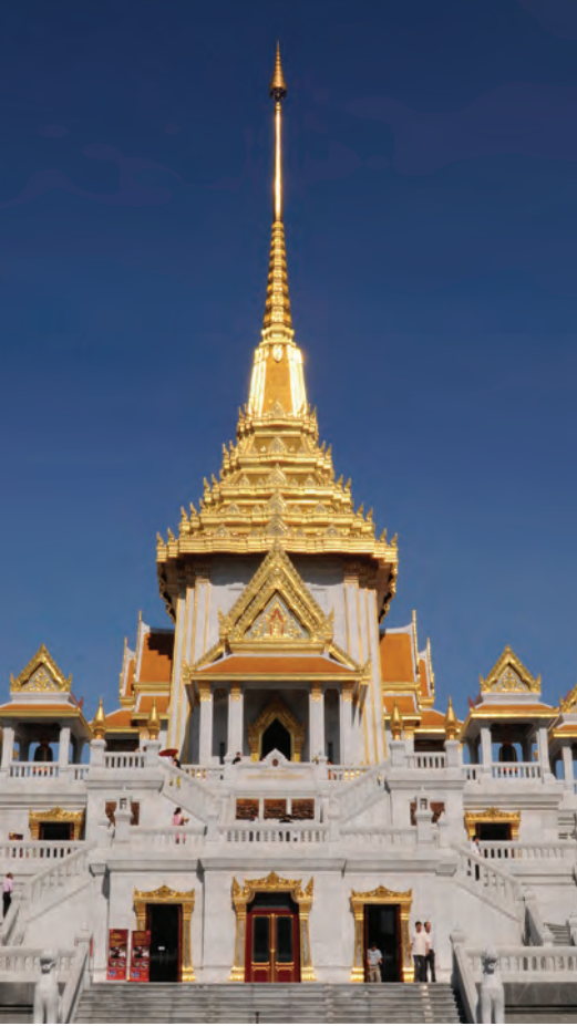
Wat Trai Mit

Open : Daily from 08.00- a.m.-05.00 p.m.