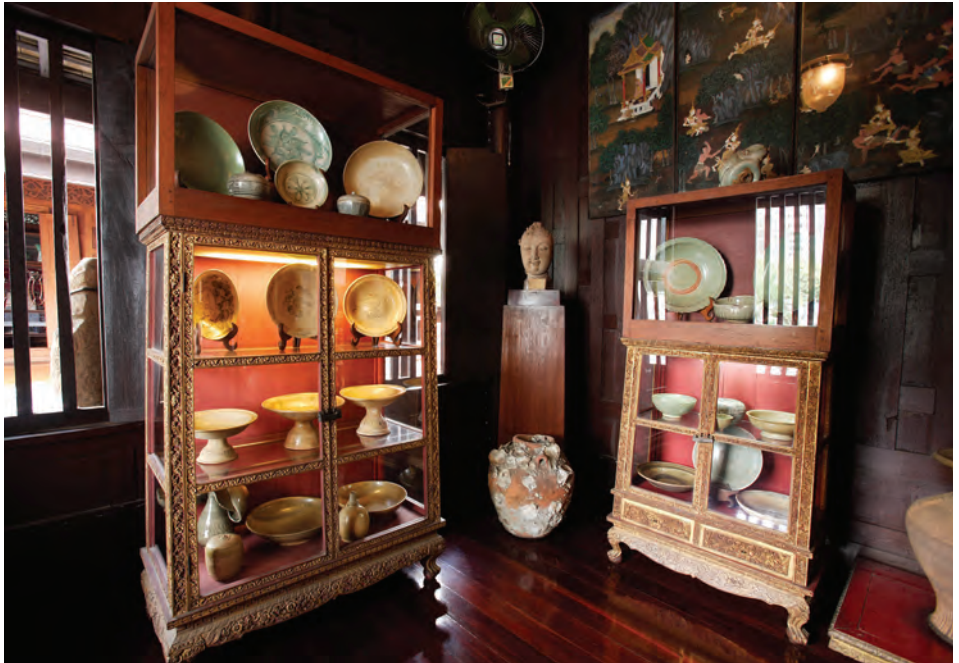
Suan Phakkad Palace