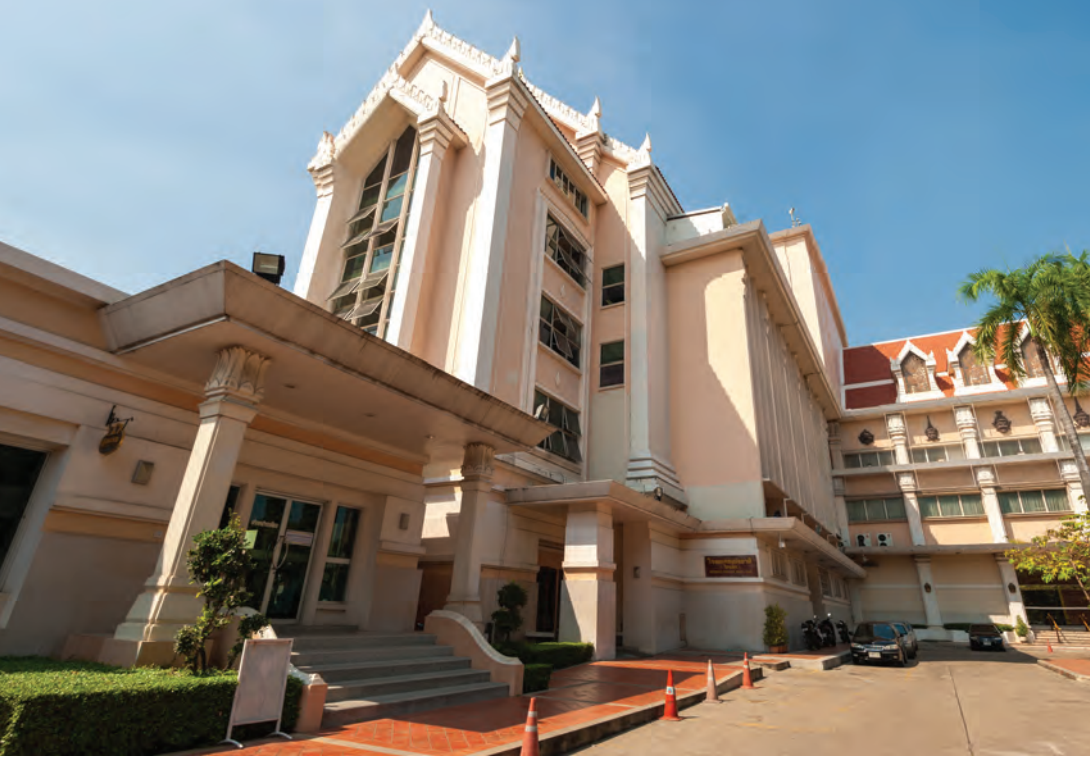
The National Theatre